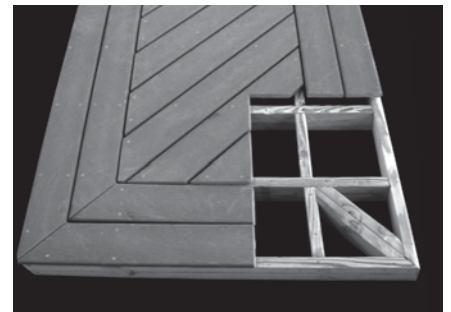
Picture Frame Pattern

NOTE: Construction methods are always improving. Please refer to www.trex.com for the most up-to-date installation requirements.