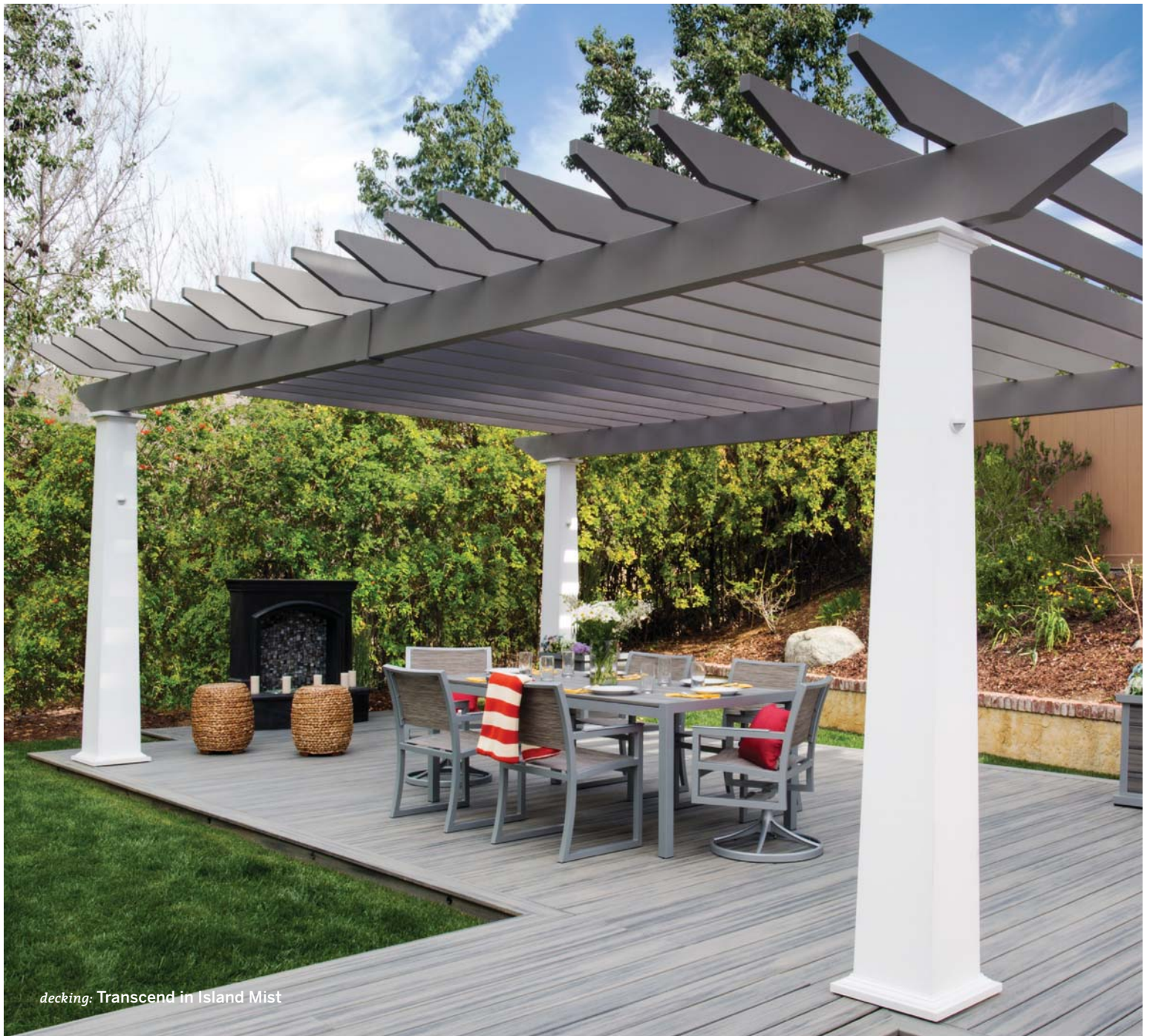
decking: Transcend in Island Mist

FRAMING | DECKING | RAILING | LIGHTING | FASCIA | STORAGE | FURNITURE | PERGOLA | DRAINAGE