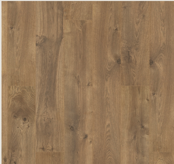
MOUNTAIN OAK | 851