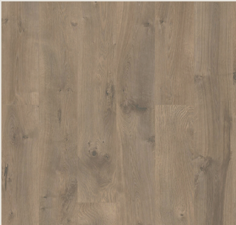
STONE CLIFF OAK | 963