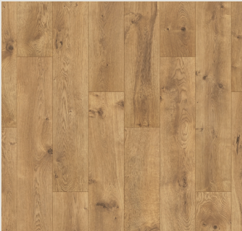
CANYON OAK | 152