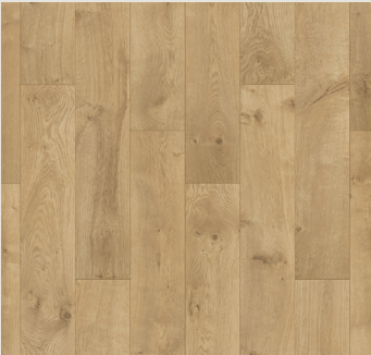
DESERT OAK | 138

PREMIUM ATTACHED PAD Foam pad for thermal insulation, cushioning, and sound barrier.