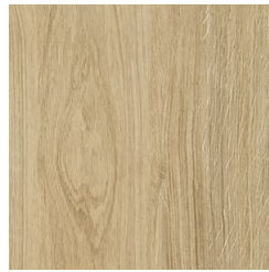
300 BROKEN HILL