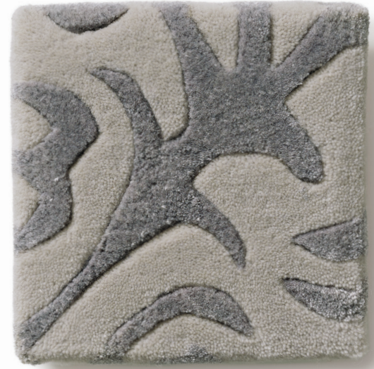
HTR91065 High Low Cut with Carve

Our hand-tufted area rugs are available in a range of constructions to bring the texture of your design to life. Choose your construction, or let us translate your design into the right mix of cuts and loops, at the right heights, to maximize visual and textural impact.