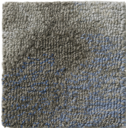
HTR91066 Level Cut Loop with Tip Shear

When your rug is first created, the thick surface pile is all loops. To add plushness and help emphasize aspects of the pattern and palette, all or just certain loops can be cut. The contrast of looped and cut pile in different heights increases the presence and beauty of your design.