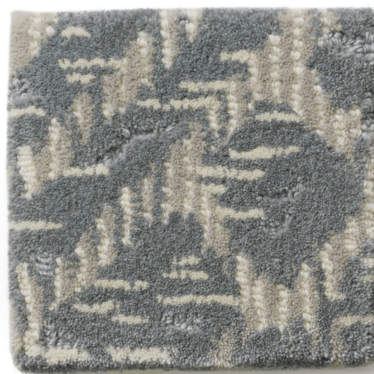
HTR91068 High Cut, High Low Loop / Machine-Tufted