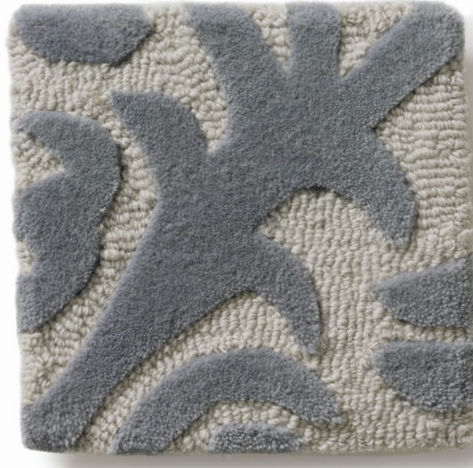
HTR91064 High Cut Low Loop