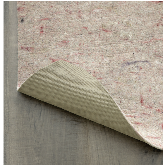
Down Under, Premium Dual Surface Rug Pad (DR002)

A rug pad helps keep your area rug in the same place on the floor, preventing the rug from sliding when walked on and providing greater safety underfoot for the people in your space. Thicker pads will also further increase cushioning and comfort.