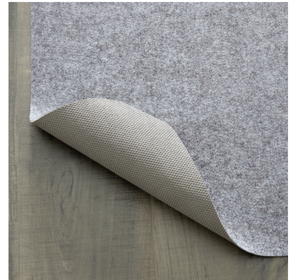
Thin Lock Rug Pad (DR010)