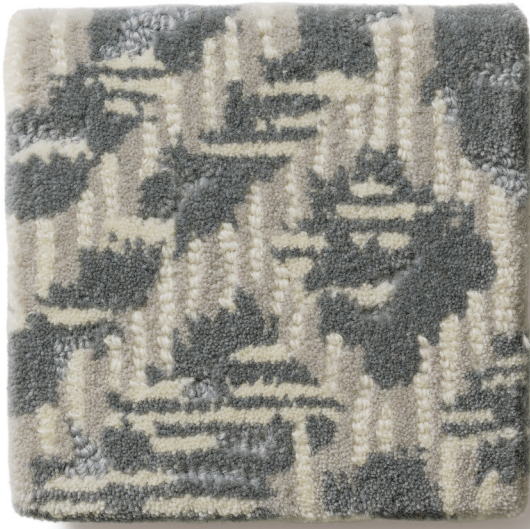
HTR91069 High Cut, High Low Loop / Hand-Tufted