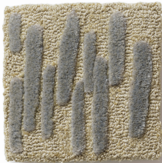
HTR91062 High Cut Low Loop