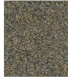
862 Blissful Bronze