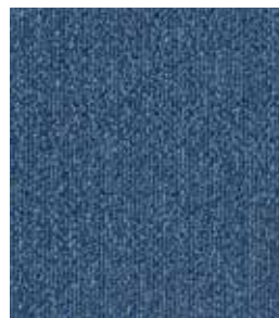
565 Serendipity Sapphire