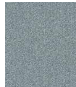
935 Zesty Zinc