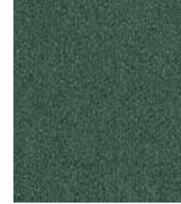
686 Friendly Fern