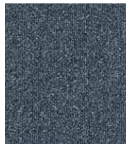
569 Sentimental Steel