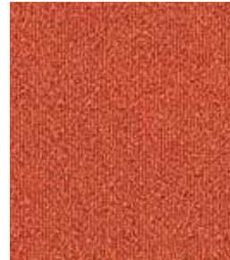
252 Nurturing Nectarine