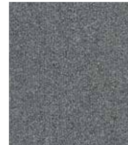
949 Silly Stone