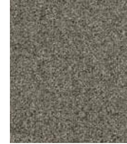
858 Dreamy Driftwood