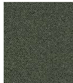
656 Playful Pine