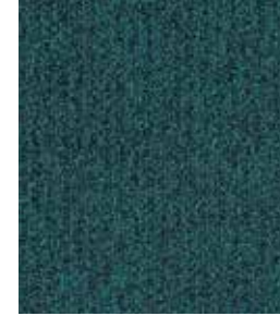
675 Tranquil Teal