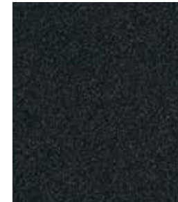
999 Mesmerizing Midnight