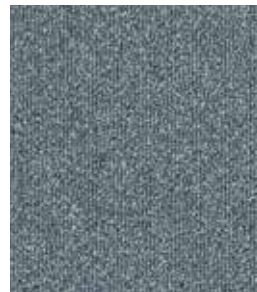
545 Dynamic Dewdrop