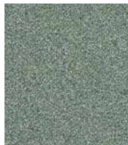
646 Enchanting Eucalyptus