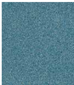
547 Spirited Sky