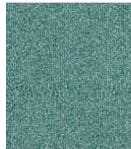
546 Loving Lagoon