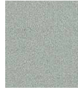
917 Whimsical Whisper