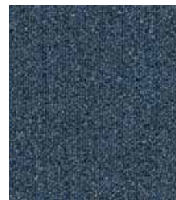
575 Moody Blue