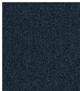
589 Independent Indigo