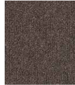
888 Unruly Umber