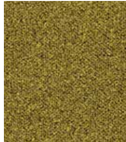
131 Sunny Disposition