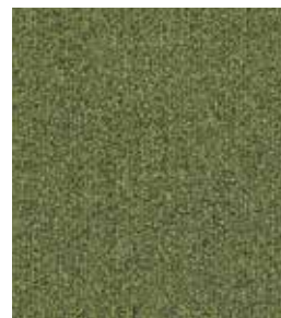
651 Graceful Green