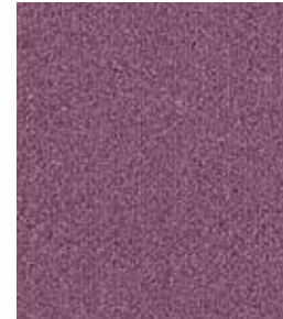
354 Reflective Raspberry