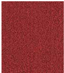
363 Cheerful Cherry