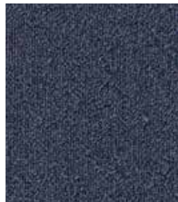
484 Uplifting Ultraviolet