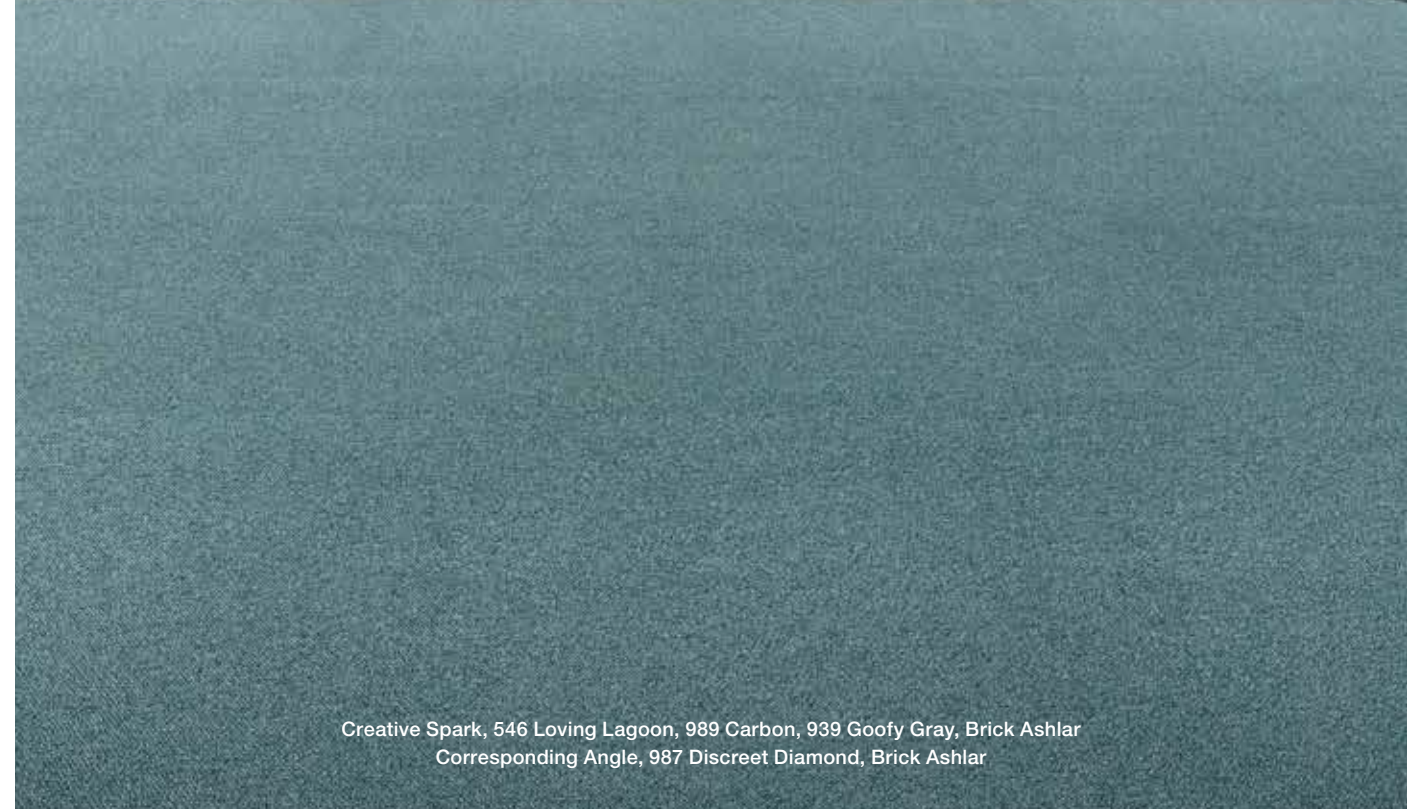
Creative Spark, 546 Loving Lagoon, 989 Carbon, 939 Goofy Gray, Brick Ashlar Corresponding Angle, 987 Discreet Diamond, Brick Ashlar