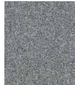
939 Goofy Gray