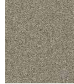
854 Subtle Sepia