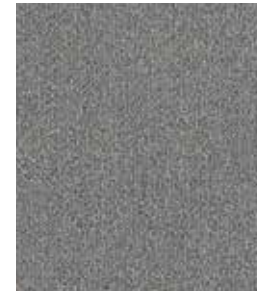
954 Sublime Silver