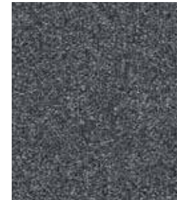
969 Serendipitous Slate