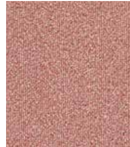
332 Pondering Petal