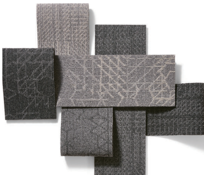
Cover: Angled Perception and Hidden Dimension 979 Metal Grey, 989 Dark Charcoal (Half-Lap Installation)

Change your perspective with Visual Edge, a new take on hierarchy and structure that creates a flowing graphic pattern derived from nature. This biophilic hexagonal design comes in two plank styles that layer elements and change scale to guide you through space, similarly to a bird's eye view of the ground below. Patterns in a space can shrink or grow in scale to adjust to the changing formats of space in the built environment.