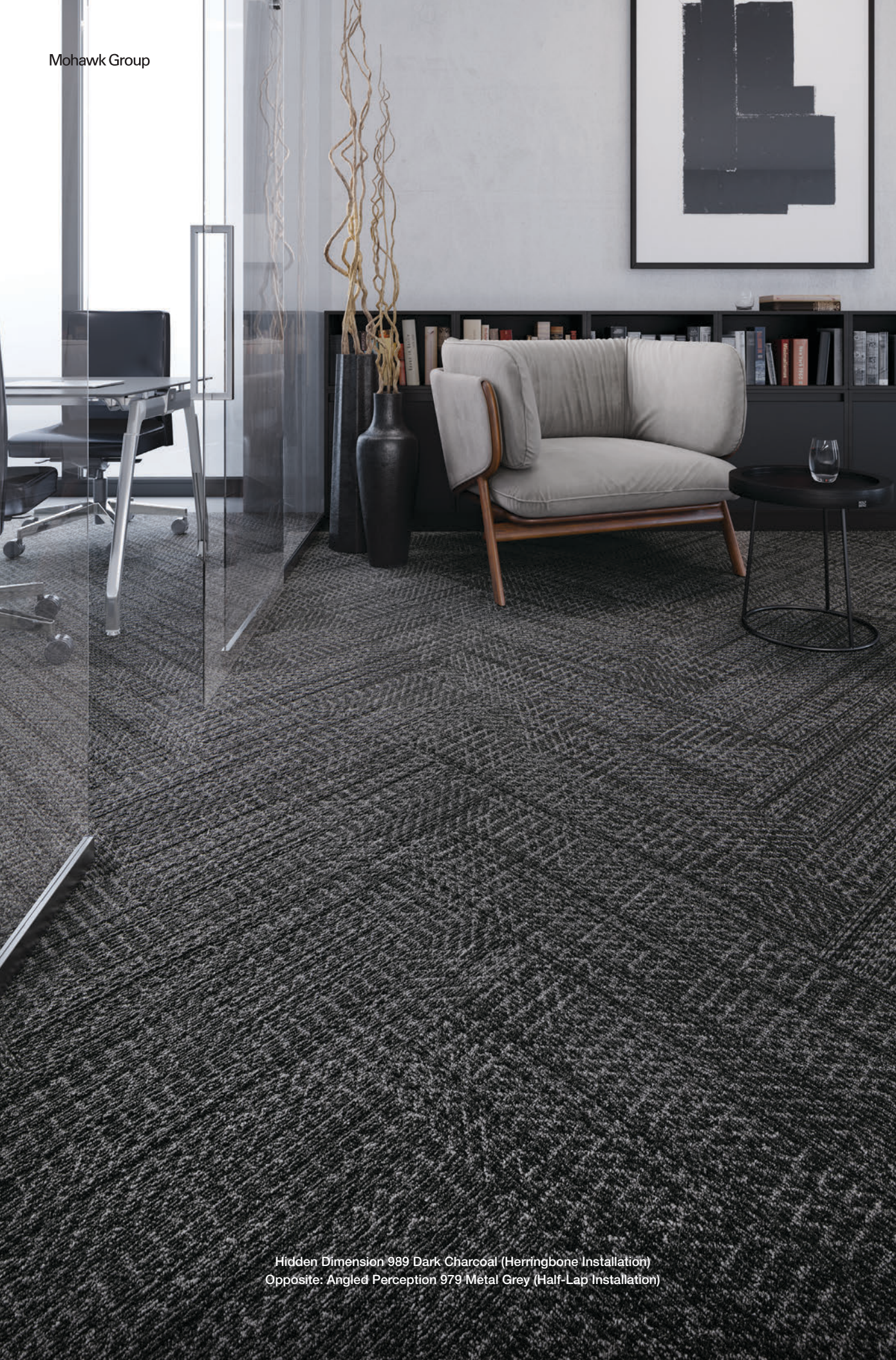
Hidden Dimension 989 Dark Charcoal (Herringbone Installation) Opposite: Angled Perception 979 Metal Grey (Half-Lap Installation)