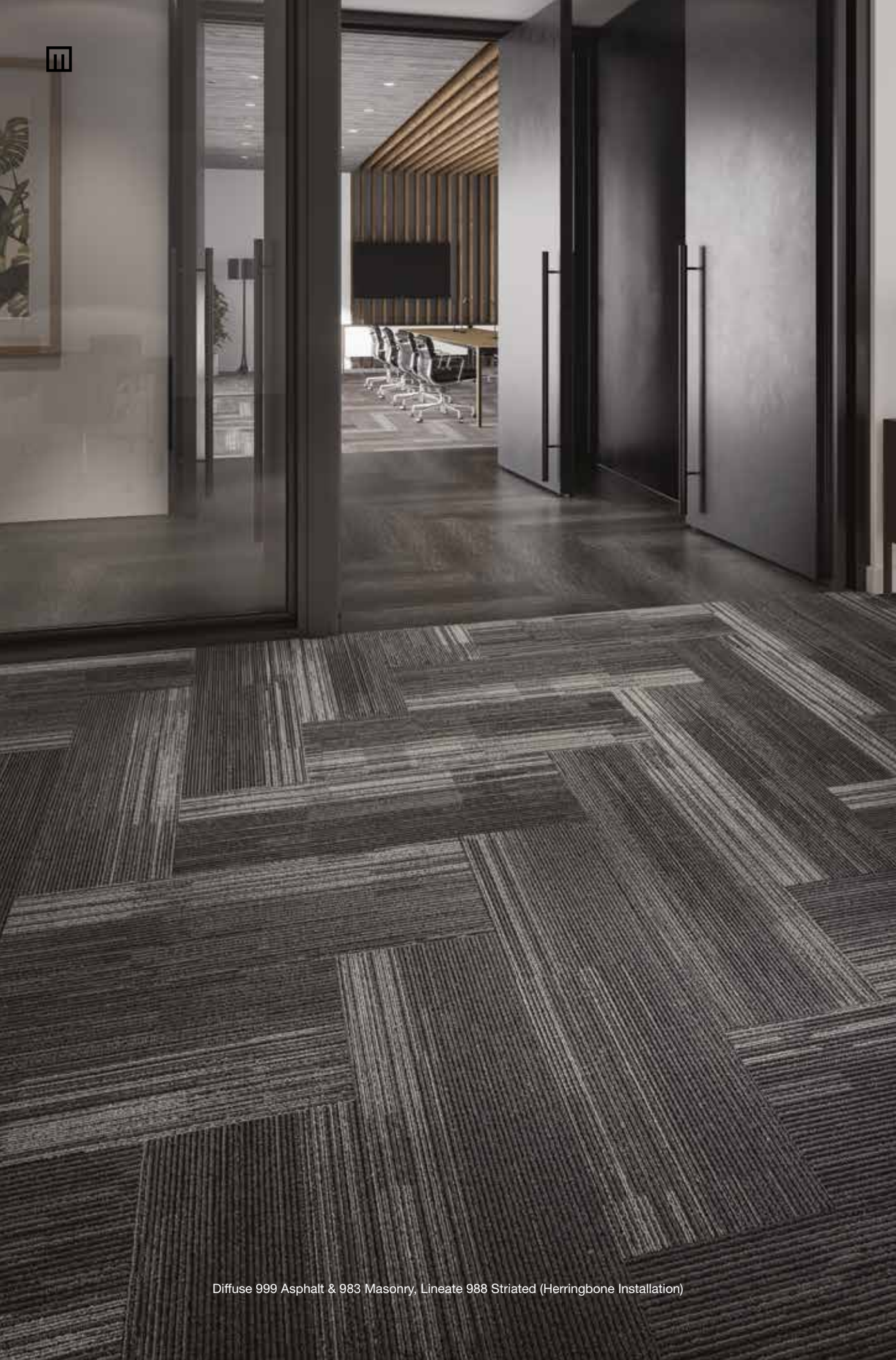
Diffuse 999 Asphalt & 983 Masonry, Lineate 988 Striated (Herringbone Installation)