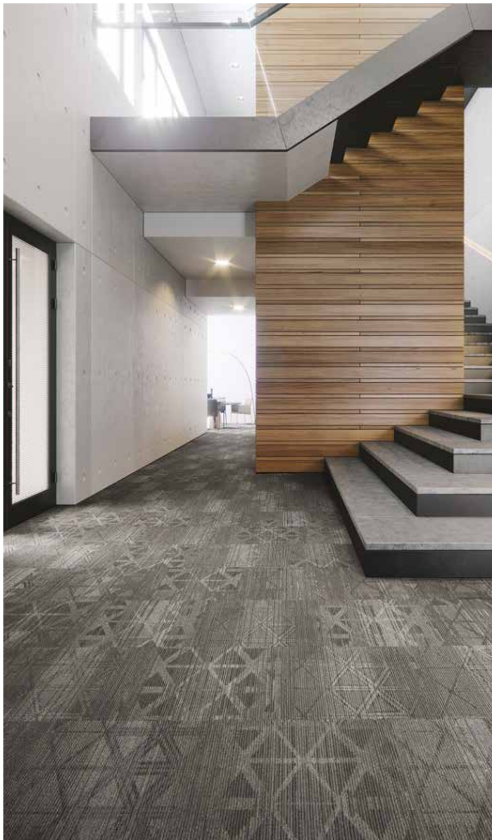
Integrate 983 Masonry (Brick Ashlar Installation)