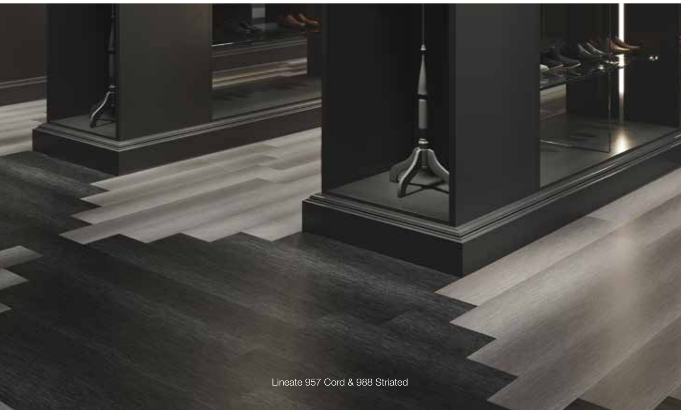
Lineate 957 Cord & 988 Striated