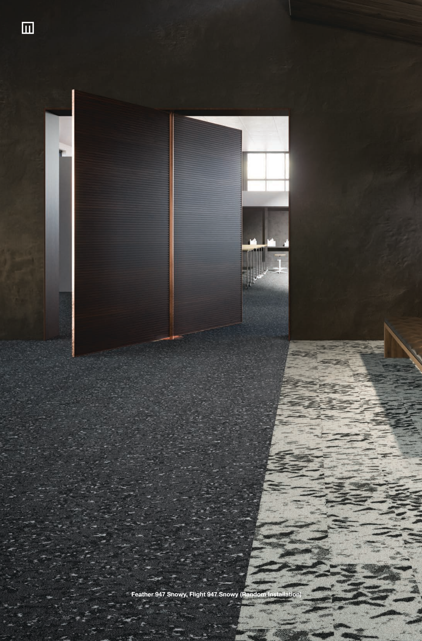
Feather 947 Snowy, Flight 947 Snowy (Random Installation)