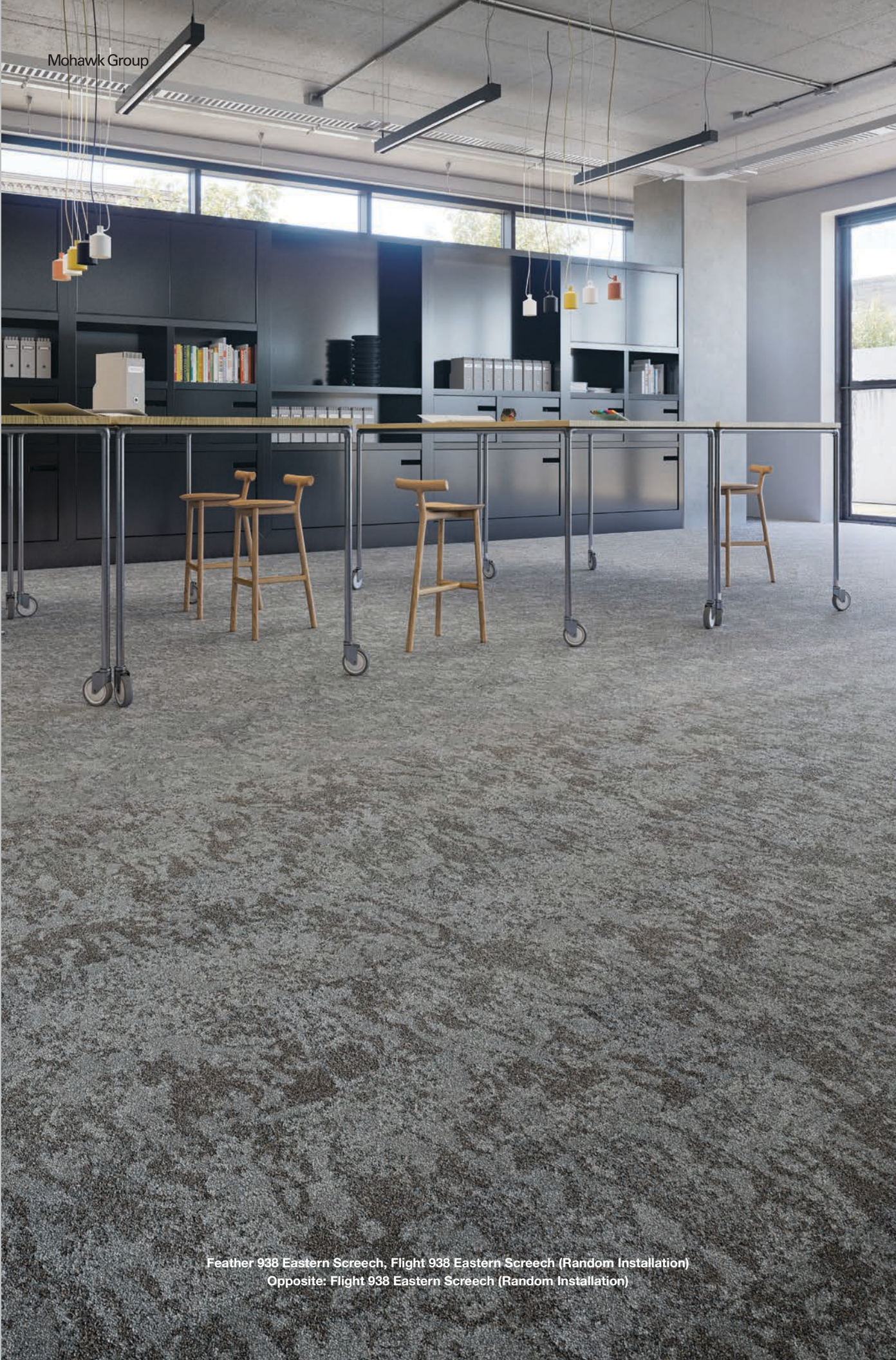
Feather 938 Eastern Screech, Flight 938 Eastern Screech (Random Installation) Opposite: Flight 938 Eastern Screech (Random Installation)