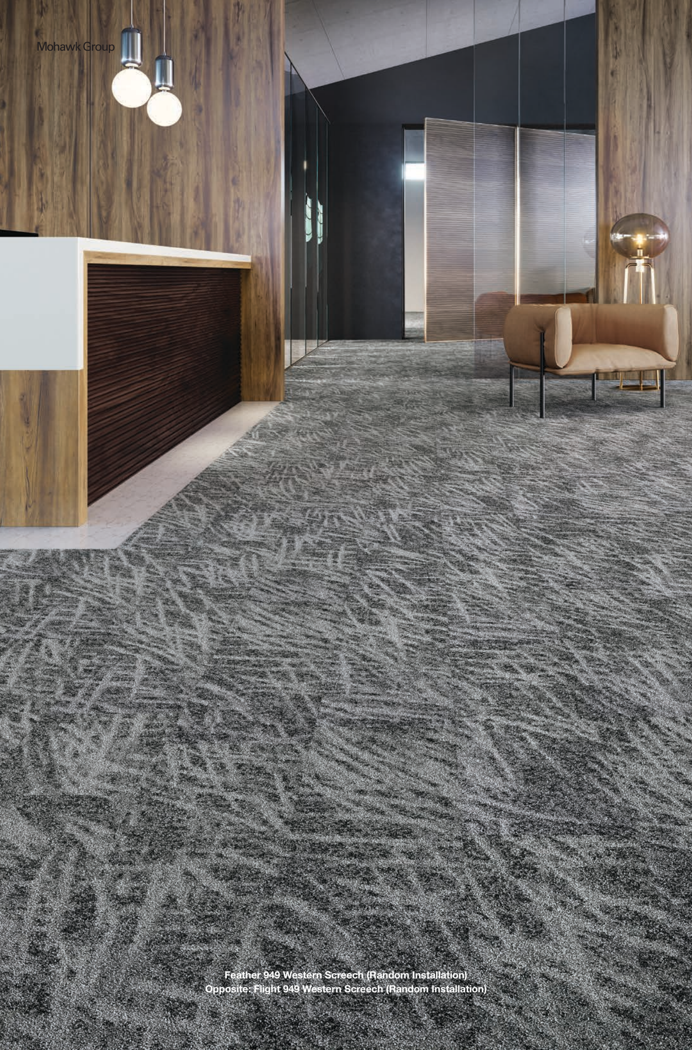
Feather 949 Western Screech (Random Installation) Opposite: Flight 949 Western Screech (Random Installation)