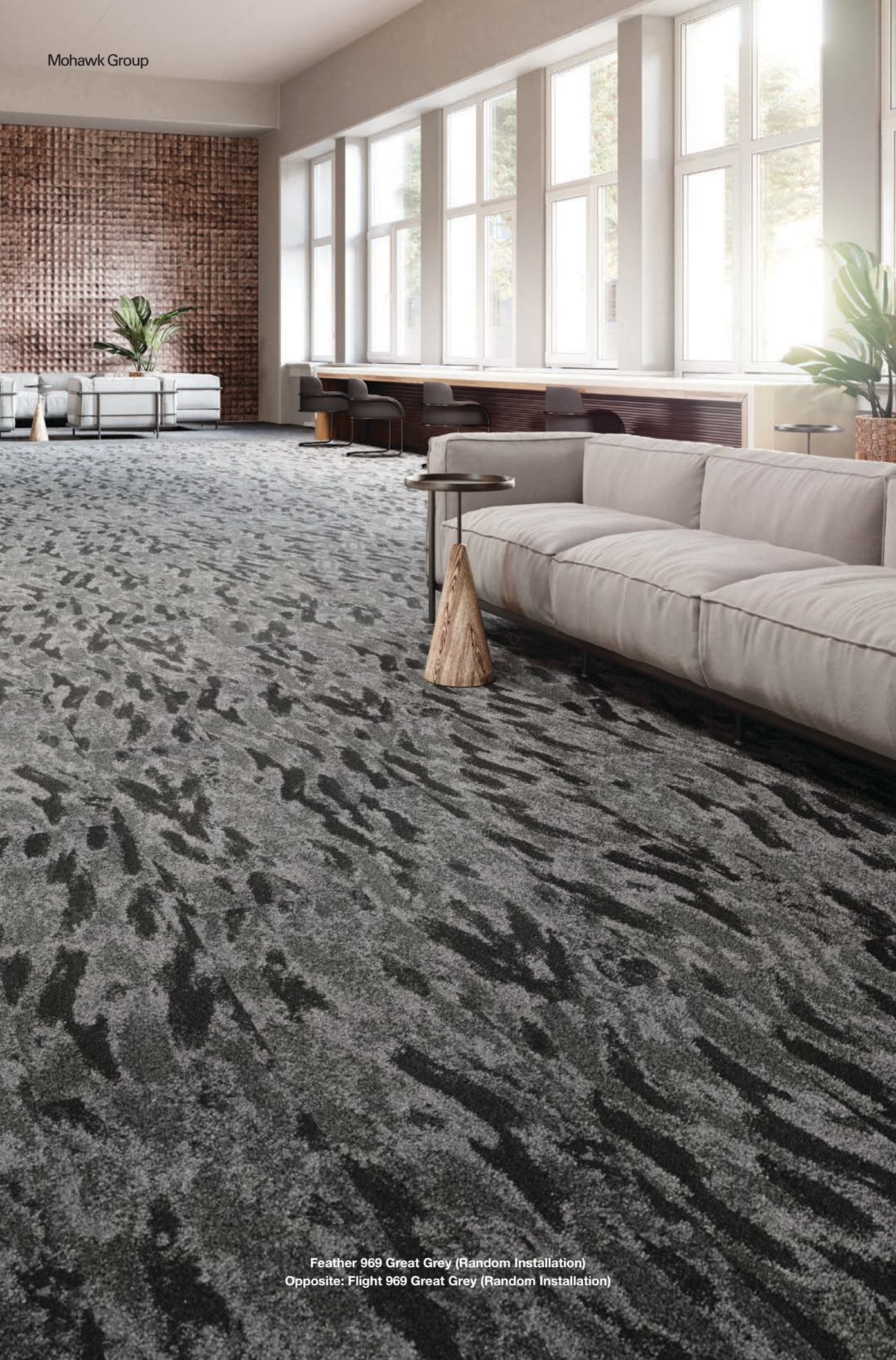
Feather 969 Great Grey (Random Installation) Opposite: Flight 969 Great Grey (Random Installation)