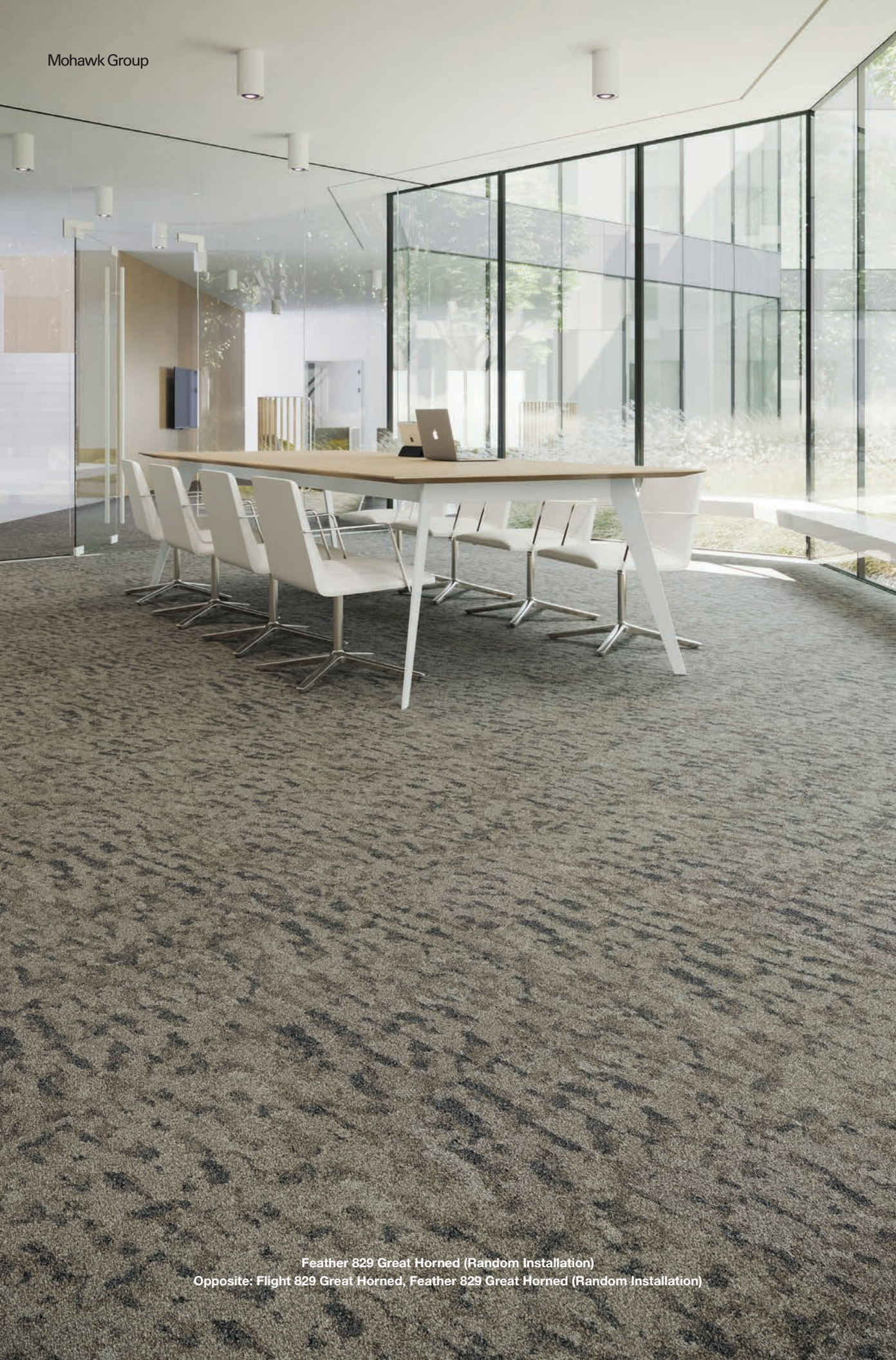
Feather 829 Great Horned (Random Installation) Opposite: Flight 829 Great Horned, Feather 829 Great Horned (Random Installation)