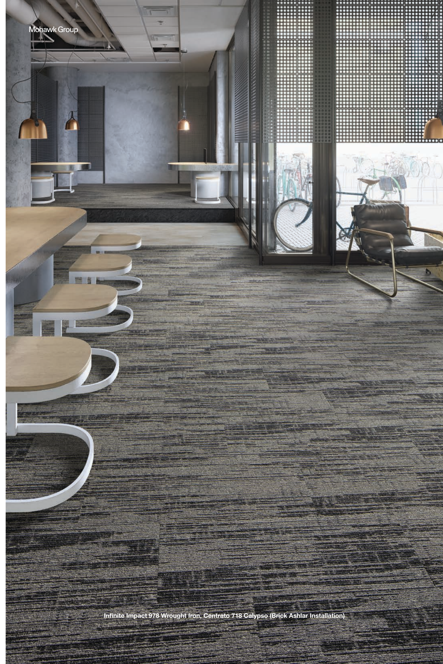
Infinite Impact 978 Wrought Iron, Centrato 718 Calypso (Brick Ashlar Installation)