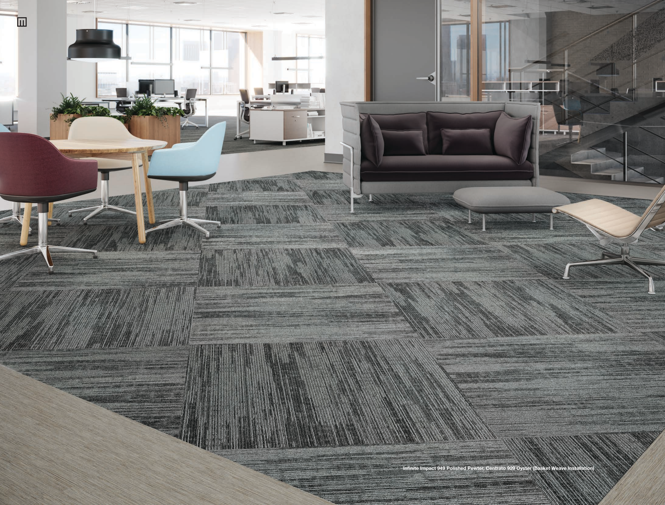
Infinite Impact 949 Polished Pewter, Centrato 929 Oyster (Basket Weave Installation)