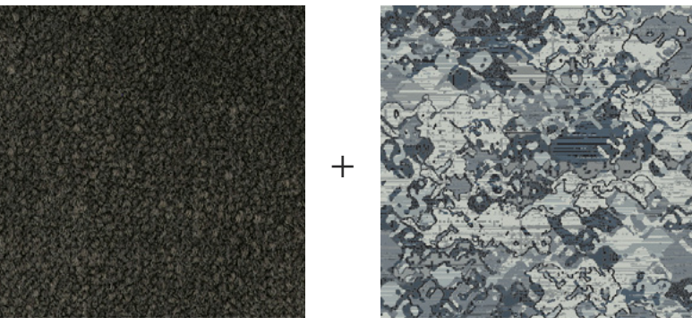
Color Study 998 Iron Mountain

Color Study perfectly pairs with Mohawk Group's other broadloom products, and allows you to easily create accents, borders, insets and more.