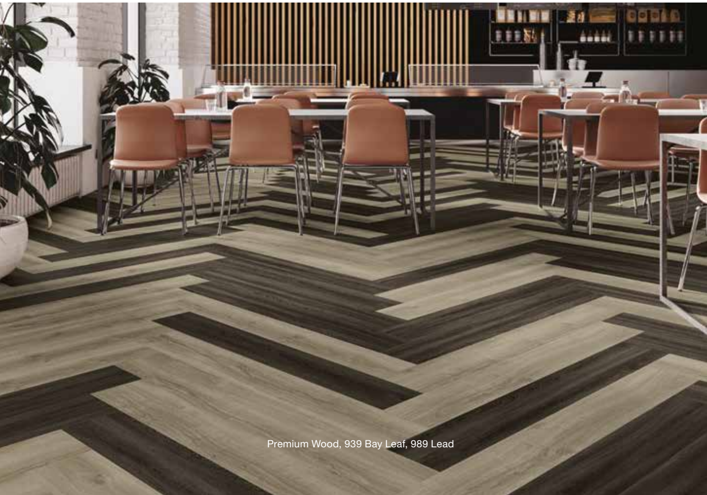
Premium Wood, 939 Bay Leaf, 989 Lead

Living Local collection is Beyond Carbon Neutral, for a Net-Positive impact.