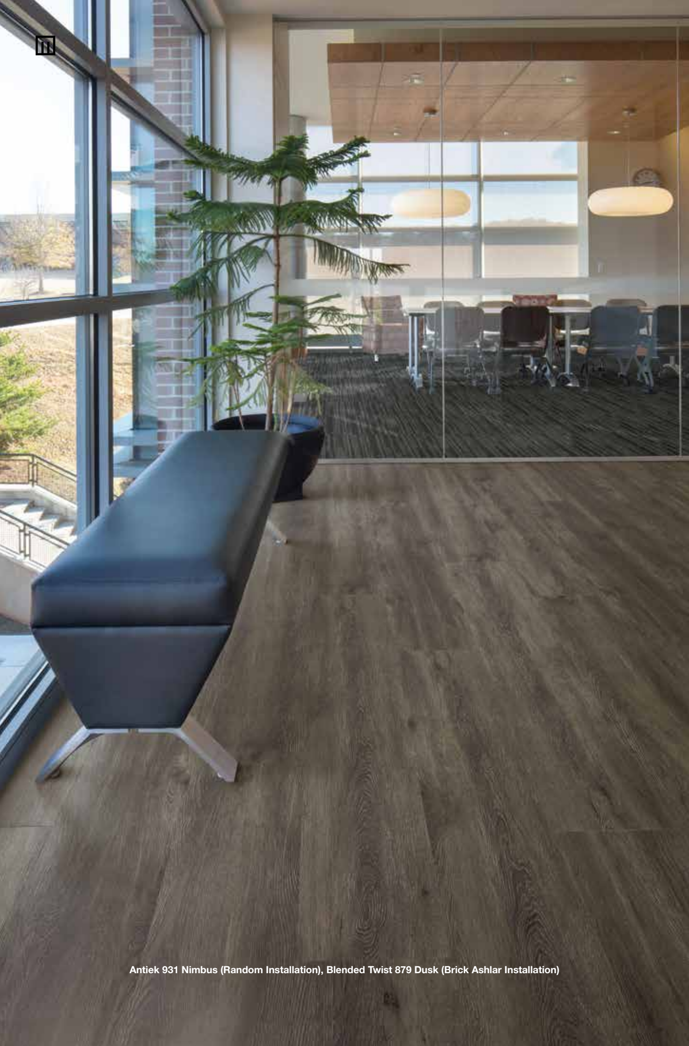
Antiek 931 Nimbus (Random Installation), Blended Twist 879 Dusk (Brick Ashlar Installation)