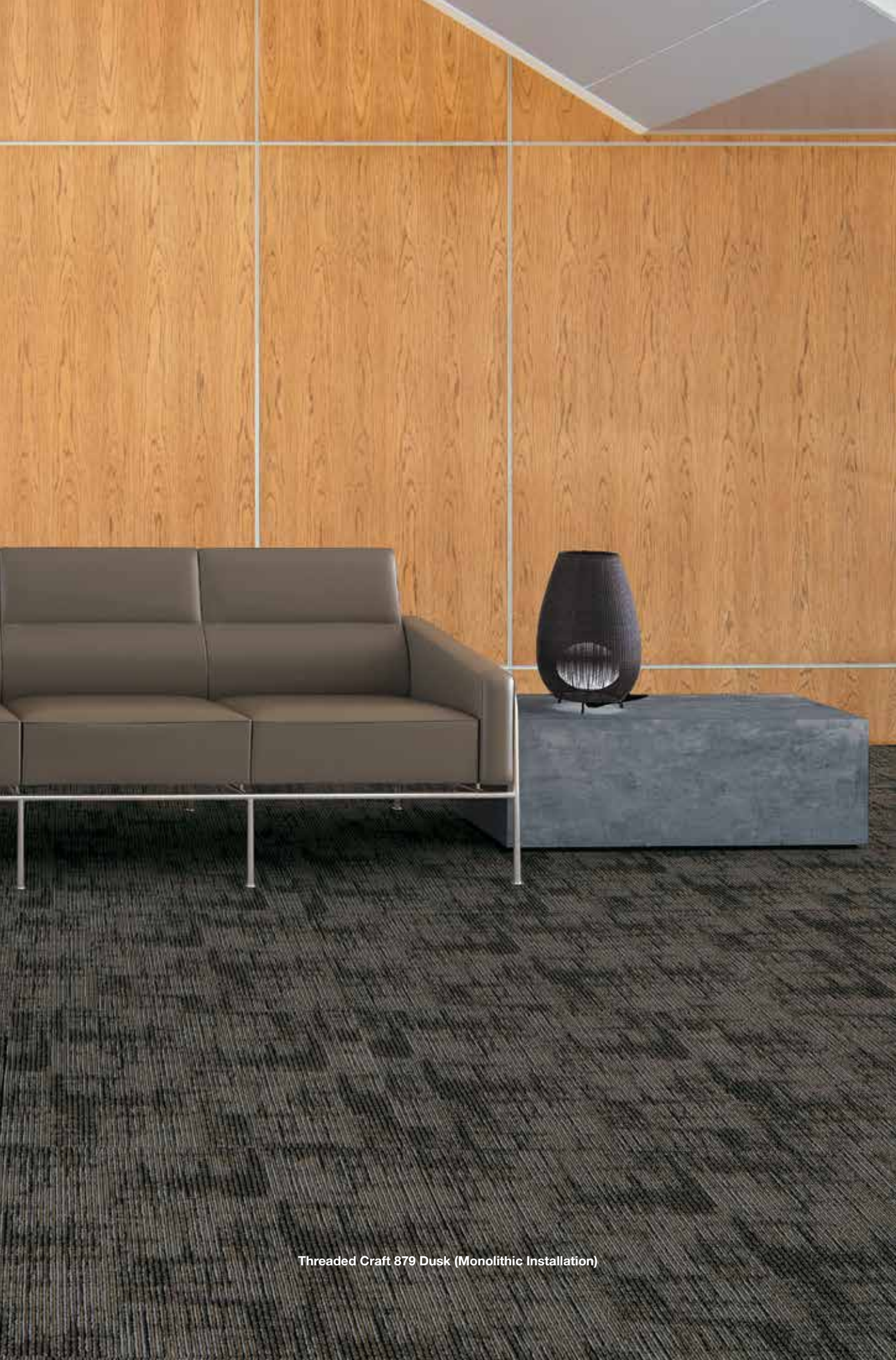
Threaded Craft 879 Dusk (Monolithic Installation)