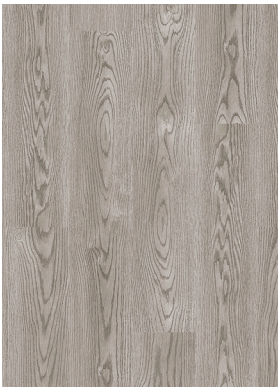
16 Grey Mist