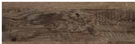
2 Saddle Brown