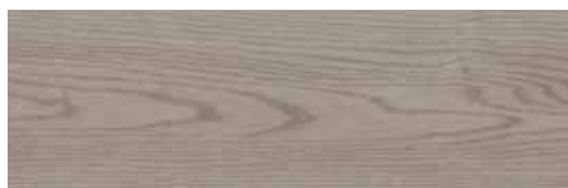
16 Storm Cloud