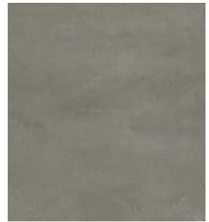
848 River Stone