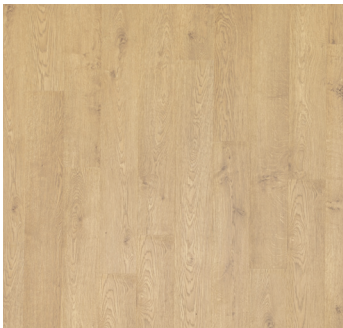
MOUNTAIN LAKE OAK | 05