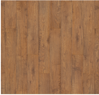
SUN DRIED OAK | 01

Colors will stay vibrant for a lifetime and will resist fading from sunlight.