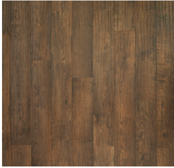
TILLED OAK | 02