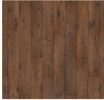
RED CLAY OAK | 03