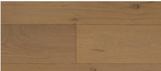
858 Weathered Oak