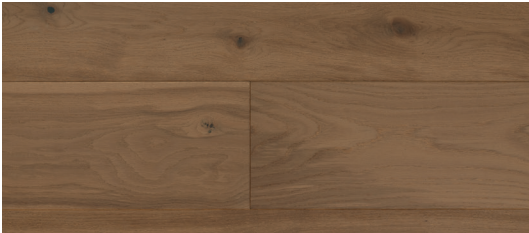
868 Wild Truffle Oak