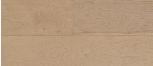
31 Sailcloth Oak