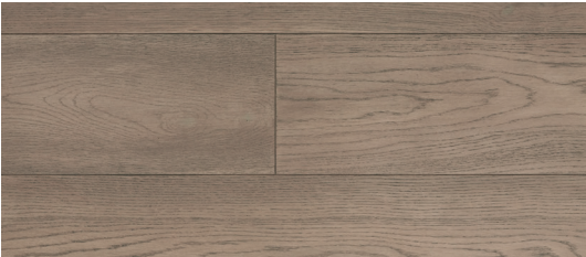
28 Coastal Fog Oak