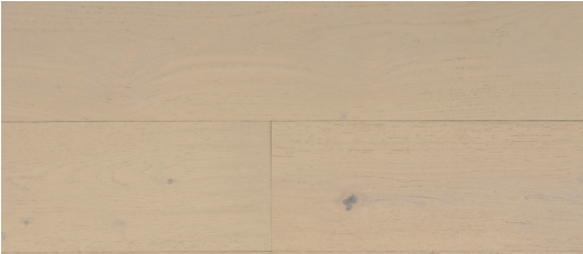
29 Seaspray Oak

Silvius National Forest Collection features a diverse palette of colorways inspired by the natural tones found in the forest. This range includes light browns that convey tranquility, moody mid-tones for added depth, and dark hues for an elevated touch. Each color option is designed to harmonize with different design aesthetics, enhancing the unique ambiance of each space.