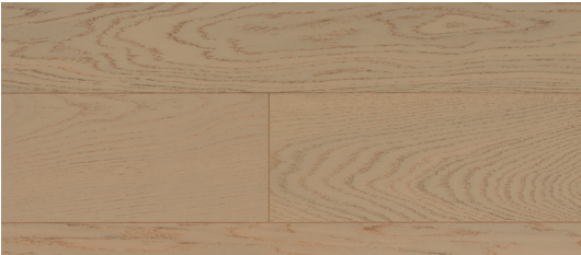
27 Beachwood Oak