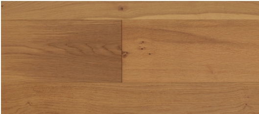
842 Timeless Oak