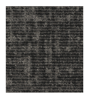
989 Ebony Slate