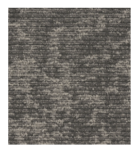
868 Shadow Grey