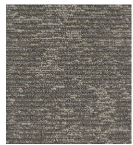
657 Olive Grove