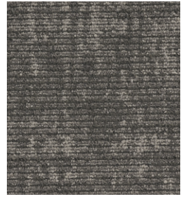
868 Shadow Grey