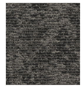
989 Ebony Slate