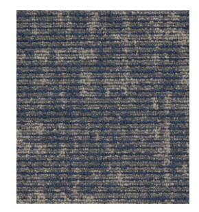
565 Inky Blue