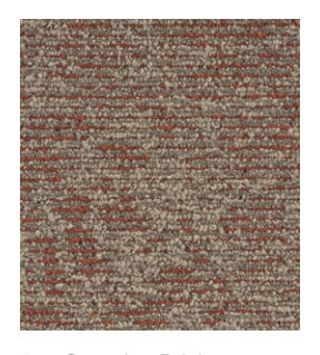
257 Georgian Brick