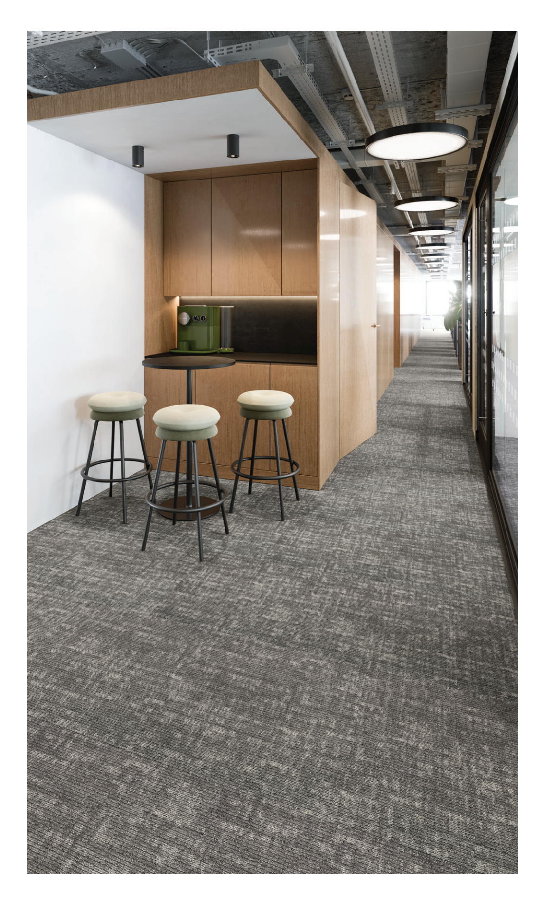
Textural Reconnect, 868 Shadow Gray Verical Ashlar