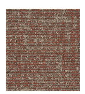
257 Georgian Brick