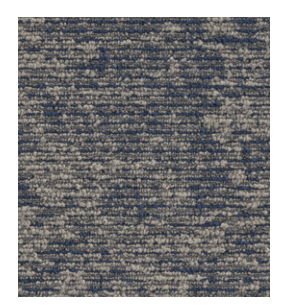
565 Inky Blue