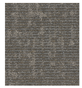
657 Olive Grove