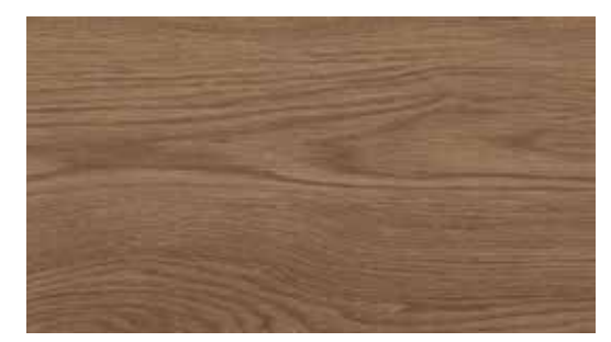
839 Burney 855 Bly