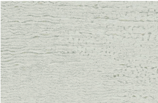
818 Elevated Silver