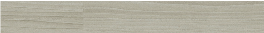
838 Affinity Suede