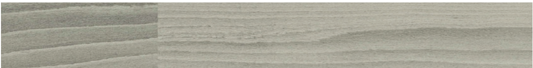
848 Haute Confluence