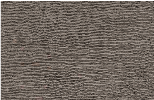
868 Embracing Ember