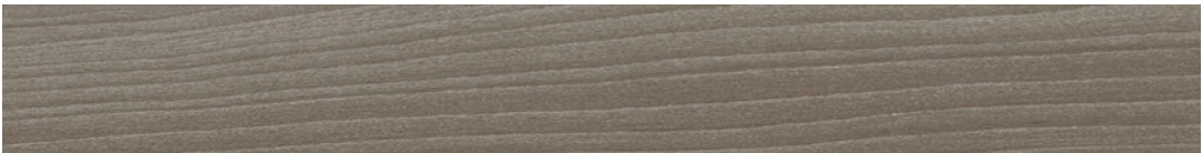
868 Embracing Ember