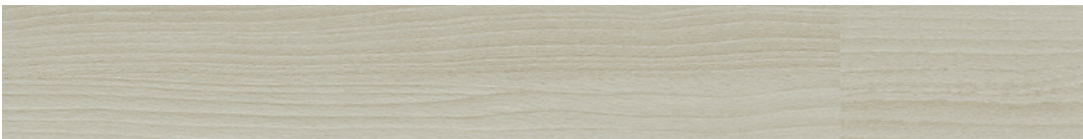
942 Radiating Shadow