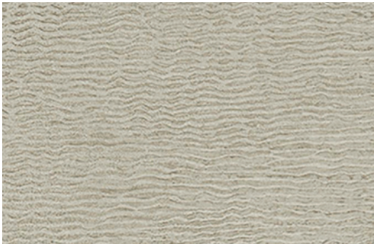
838 Affinity Suede