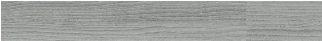
945 Connecting Cool