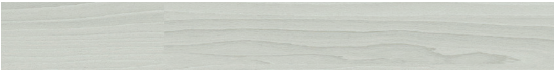
818 Elevated Silver