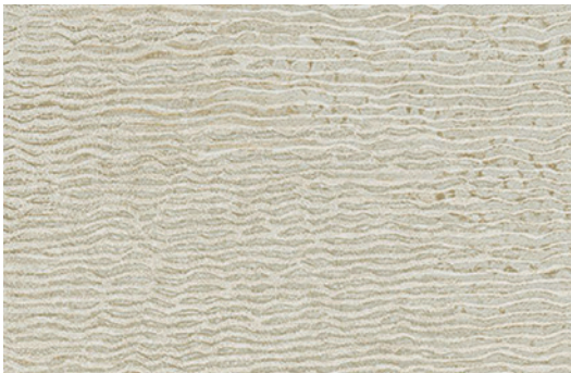
942 Radiating Shadow