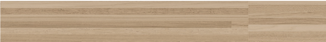
842 Unified Tone