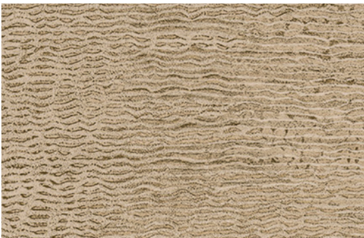
842 Unified Tone