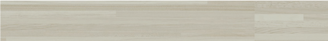
942 Radiating Shadow