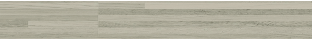
838 Affinity Suede