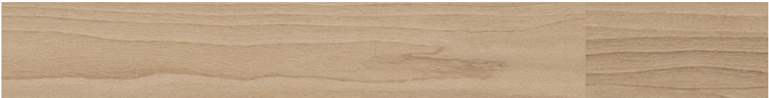
842 Unified Tone