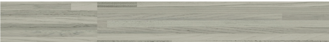
848 Haute Confluence