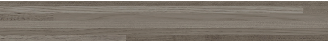
868 Embracing Ember