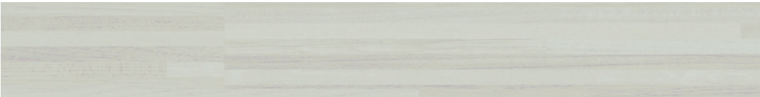
818 Elevated Silver