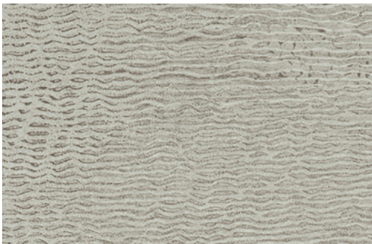
848 Haute Confluence