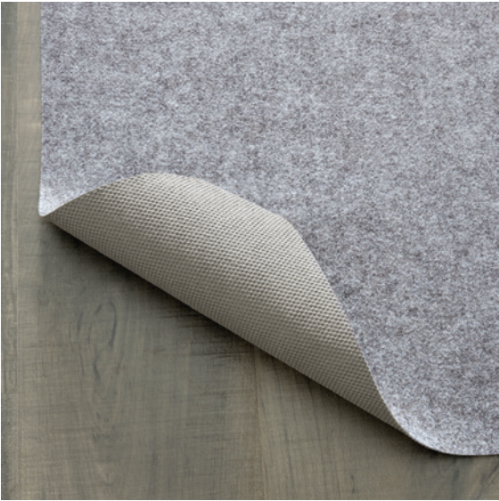
Thin Lock Rug Pad (DR010)