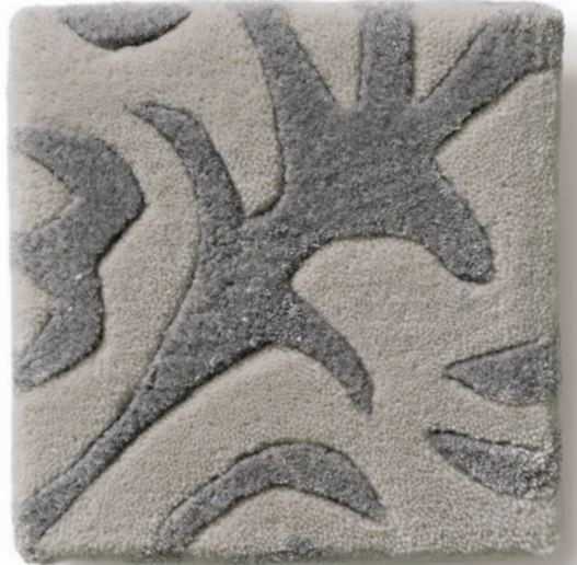
HTR91065 High Low Cut with Carve

Our hand-tufted area rugs are available in a range of constructions to bring the texture of your design to life. Choose your construction, or let us translate your design into the right mix of cuts and loops, at the right heights, to maximize visual and textural impact.