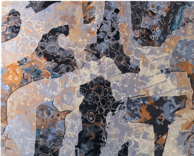
HTR100103 Abstract Artistry