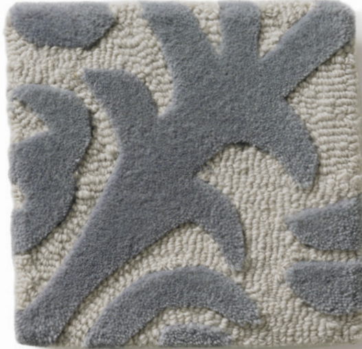
HTR91064 High Cut Low Loop