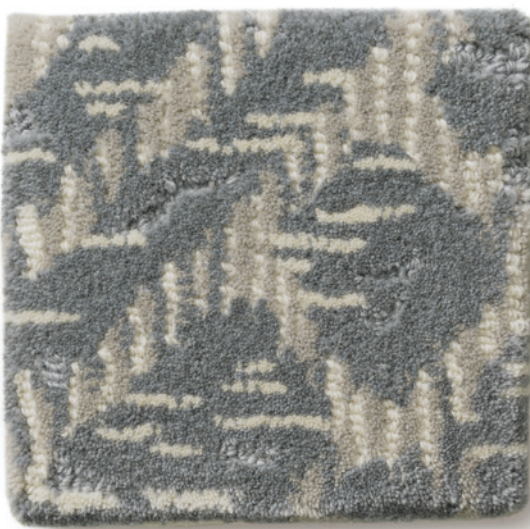
HTR91068 High Cut, High Low Loop / Machine-Tufted