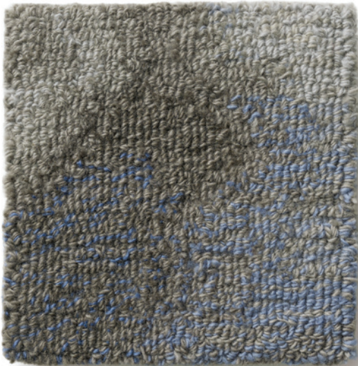
HTR91066 Level Cut Loop with Tip Shear

When your rug is first created, the thick surface pile is all loops. To add plushness and help emphasize aspects of the pattern and palette, all or just certain loops can be cut. The contrast of looped and cut pile in different heights increases the presence and beauty of your design.