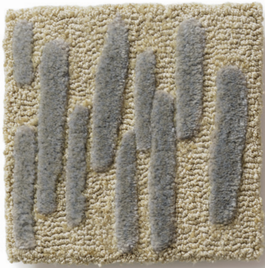
HTR91062 High Cut Low Loop