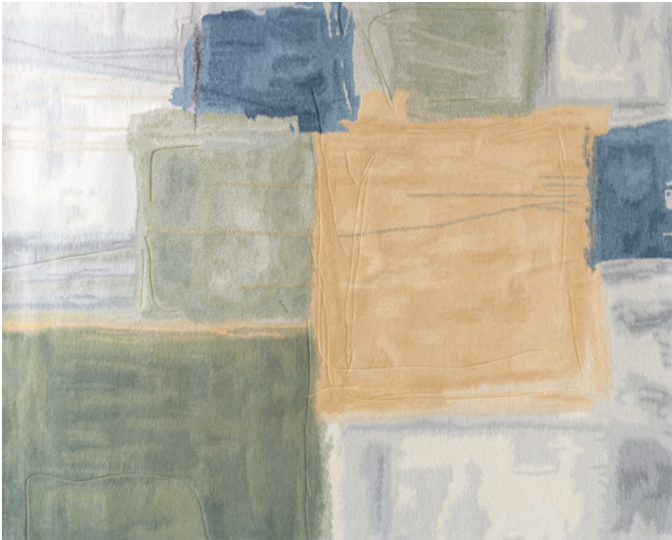
HTR100172 Social Canvas