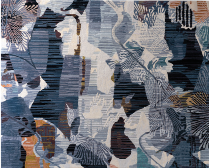
HTR100172 Painted Perspectives