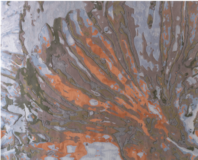
HTR100175 Above and Below