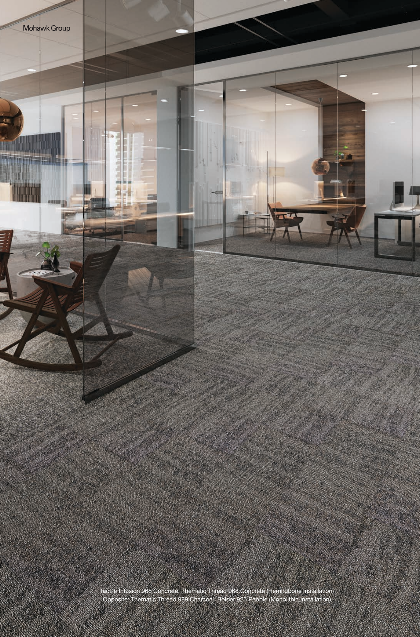
Tactile Infusion 968 Concrete, Thematic Thread 968 Concrete (Herringbone Installation) Opposite: Thematic Thread 989 Charcoal, Bolder 925 Pebble (Monolithic Installation)