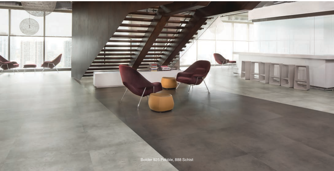
Bolder 925 Pebble, 888 Schist