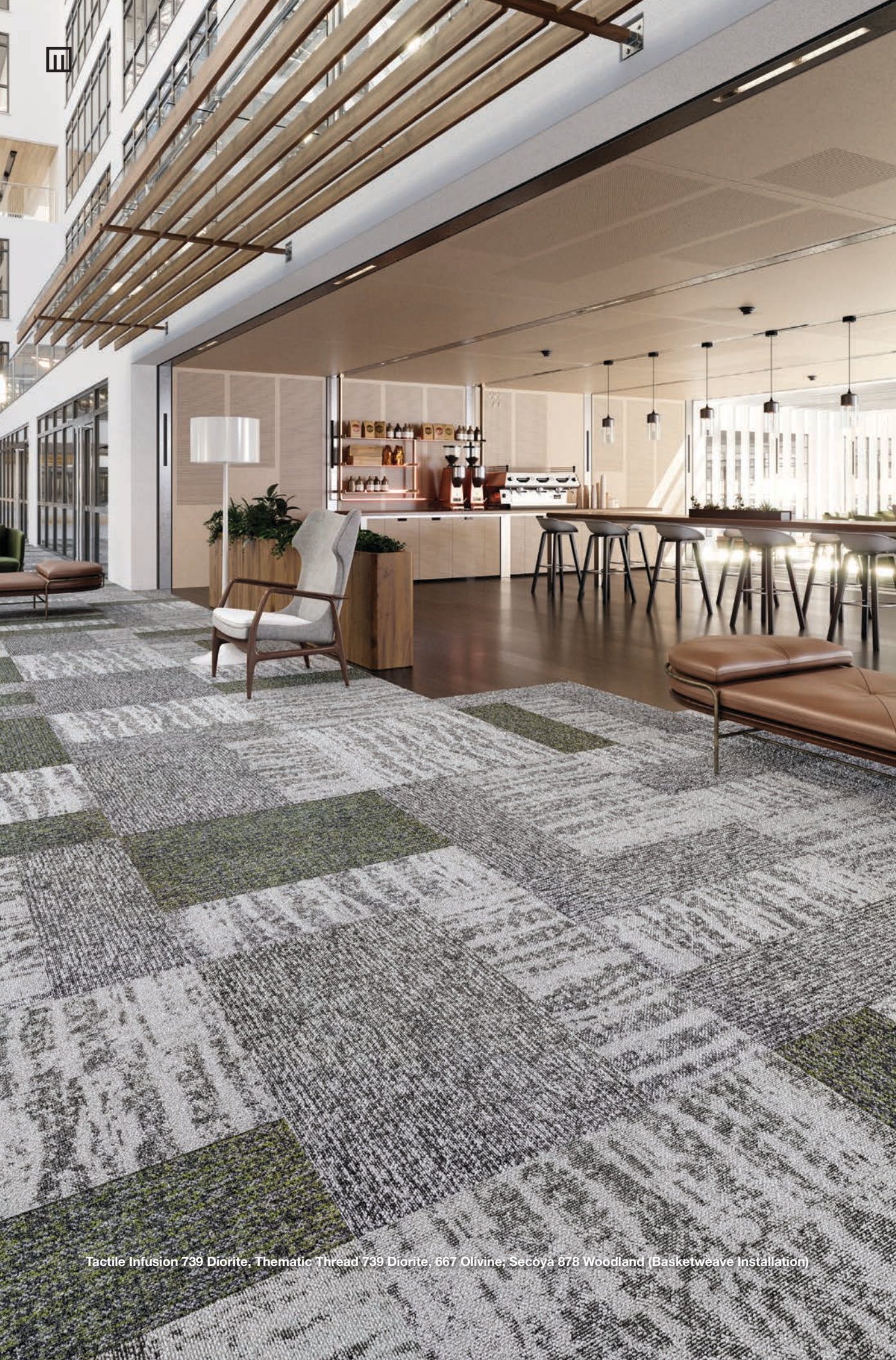
Tactile Infusion 739 Diorite, Thematic Thread 739 Diorite, 667 Olivine, Secoya 878 Woodland (Basketweave Installation)