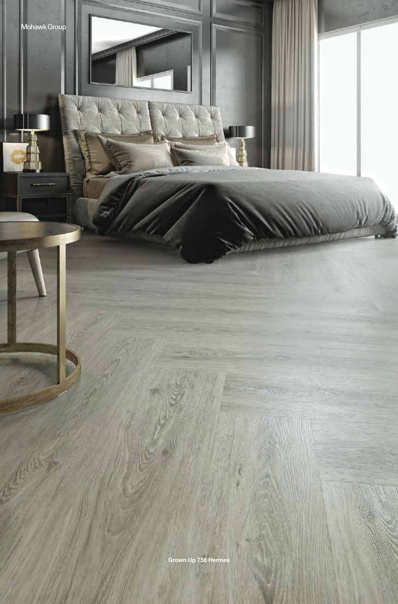
Grown Up 758 Hermes