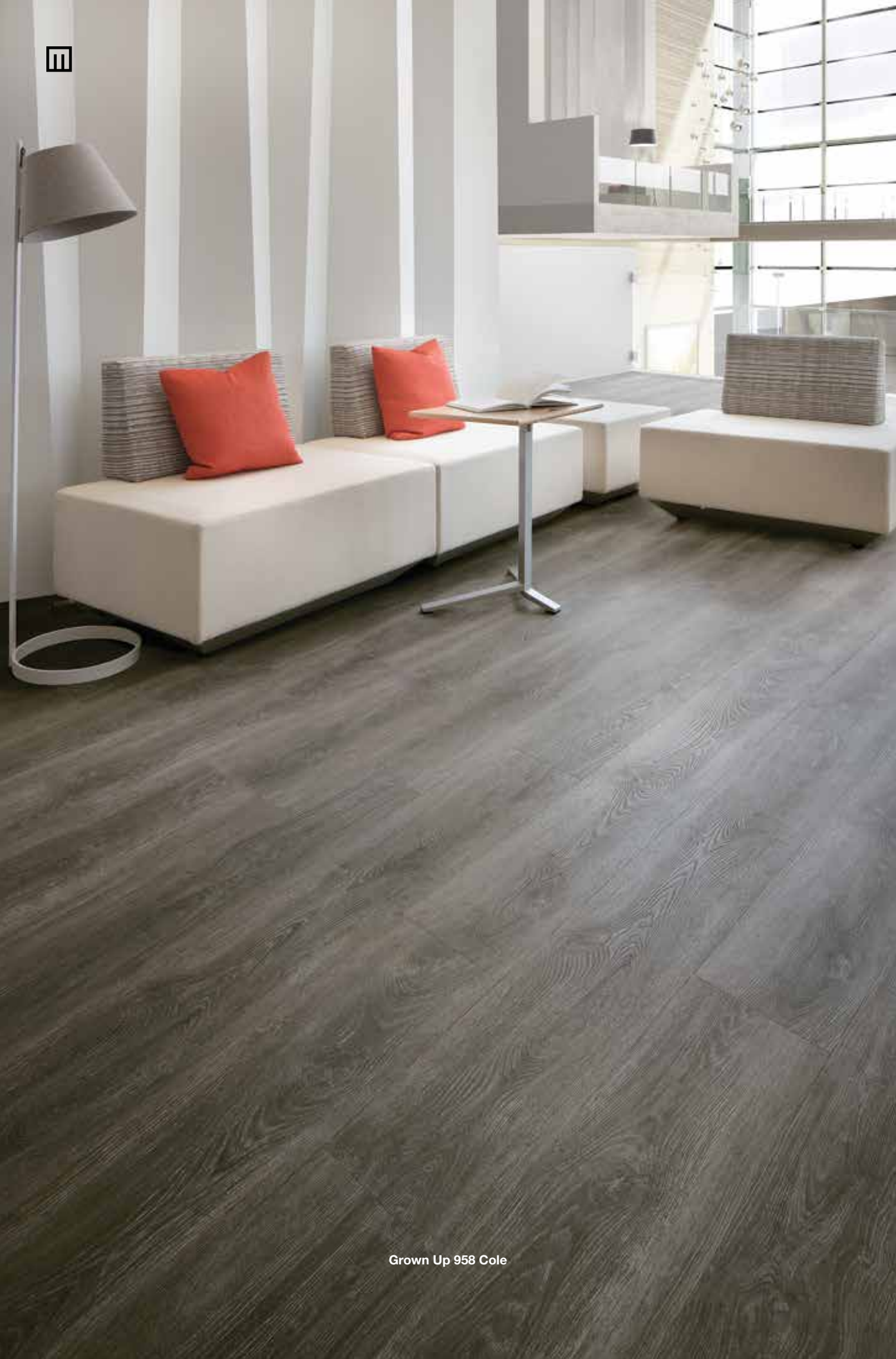
Grown Up 958 Cole