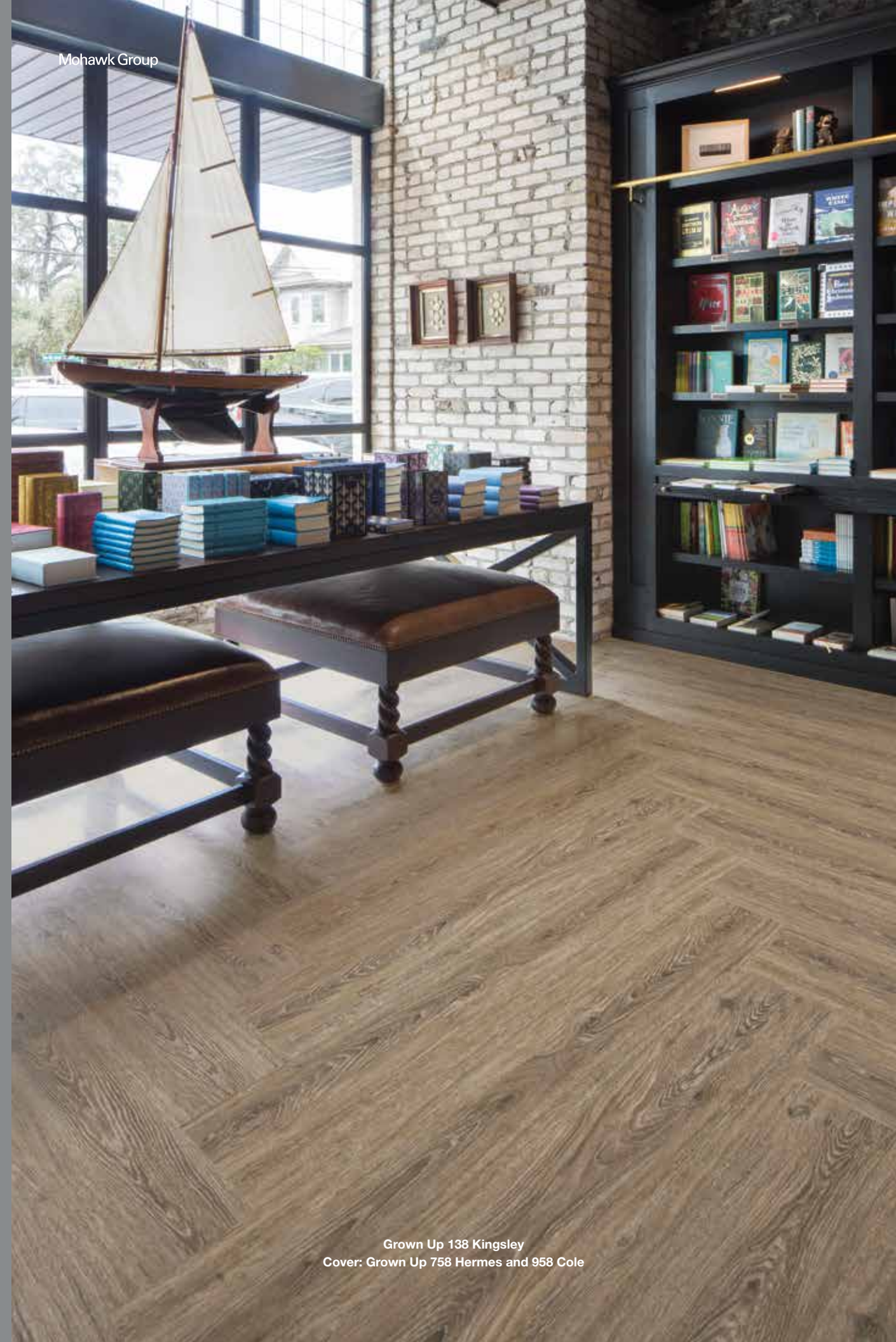
Grown Up 138 Kingsley Cover: Grown Up 758 Hermes and 958 Cole