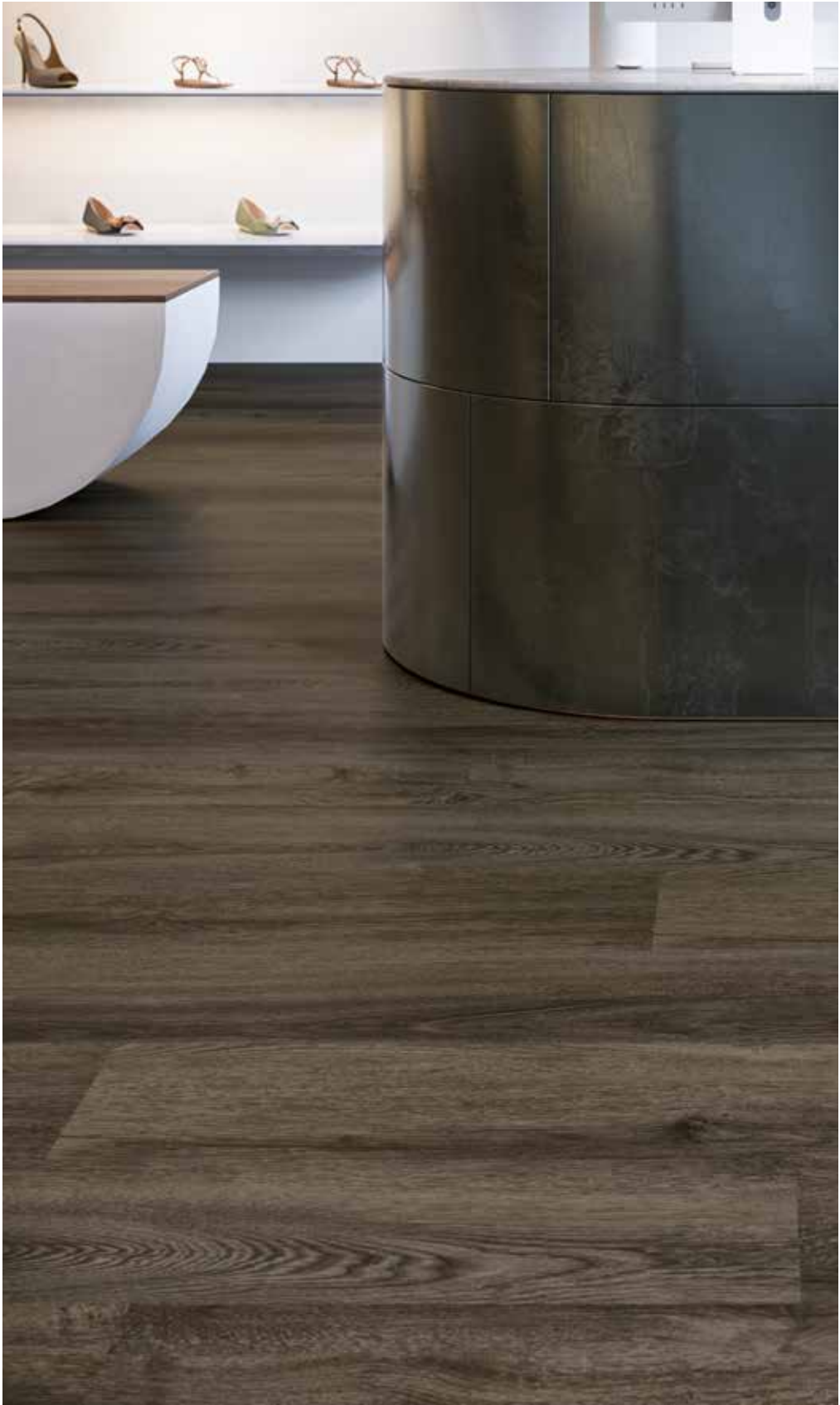
Secoya 3.0 PVC Free, 872 Toasted Oak