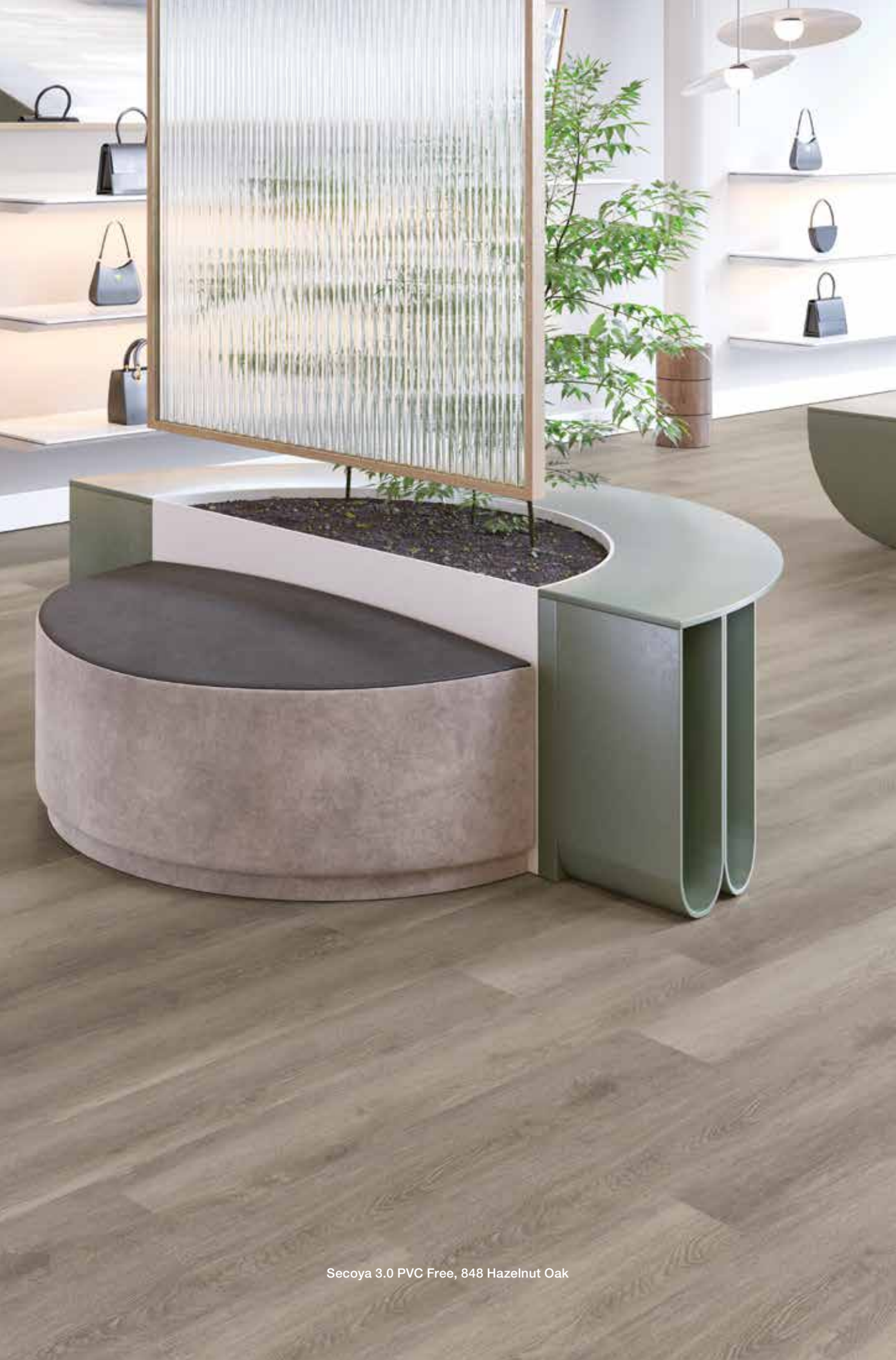
Secoya 3.0 PVC Free, 848 Hazelnut Oak