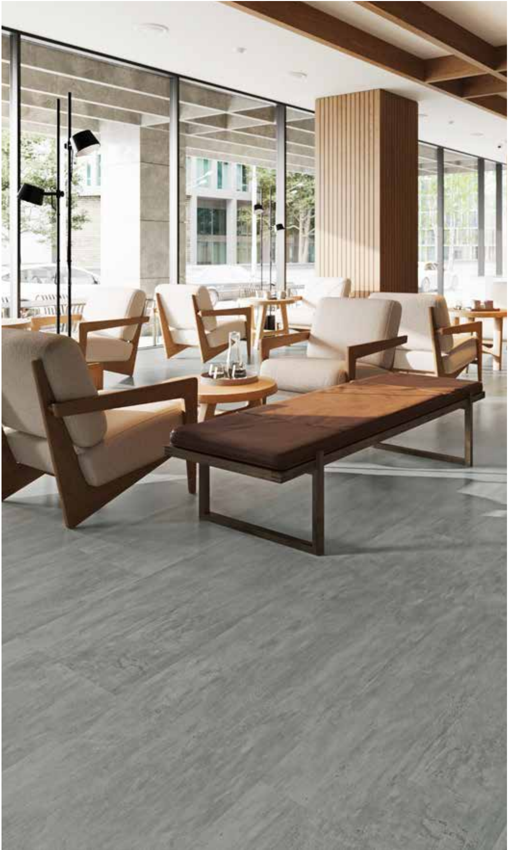
Bolder 3.0 PVC Free, 949 Lava