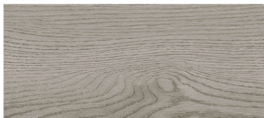
16 Morning Mist