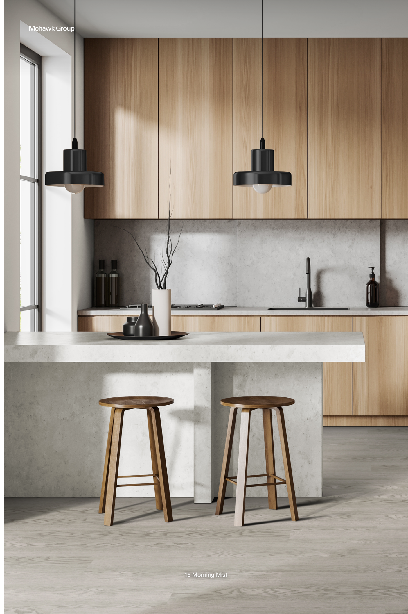
16 Morning Mist