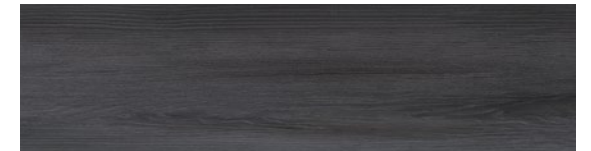
W969 Iron Ore