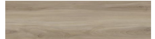
W738 Ice Dreams