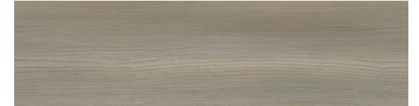
W938 Aged Smoke