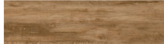
W838 Rustic Elegance