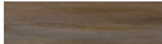
W858 Safe Haven