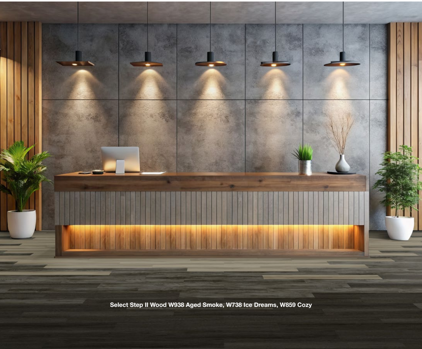
Select Step II Wood W938 Aged Smoke, W738 Ice Dreams, W859 Cozy