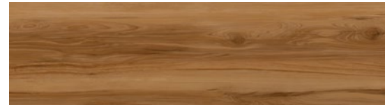
W833 Vein Narrative