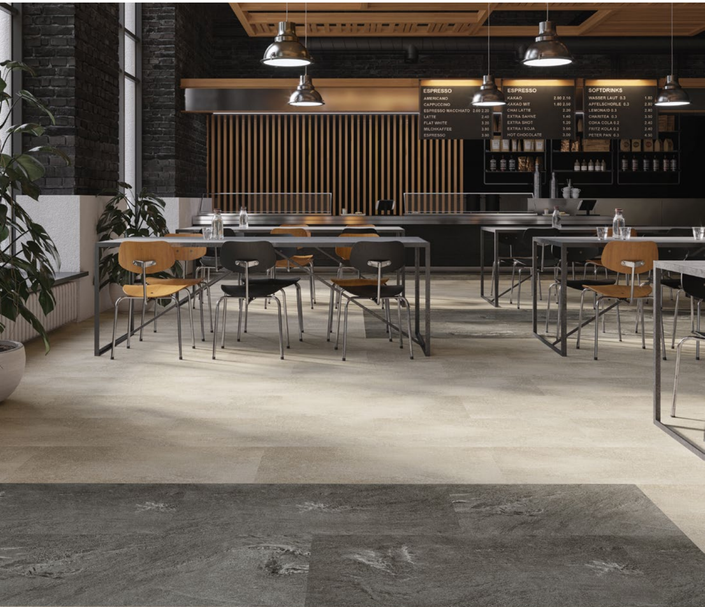
Select Step II Stone S818 Nature's Influence, 948 On the Rocks