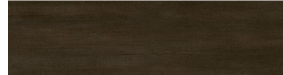
S878 Clean Slate