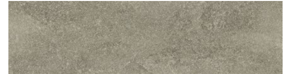
S818 Nature's Influence