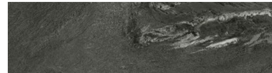
S948 On the Rocks