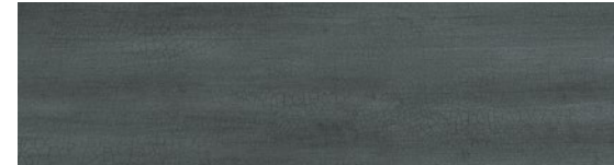
S939 Stone Cold