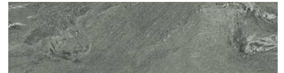
S959 Taken of Granite