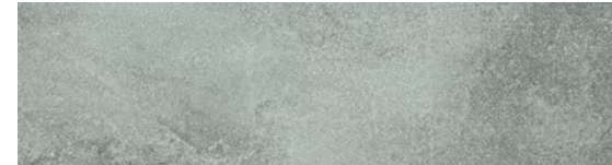
S719 Concrete Goals