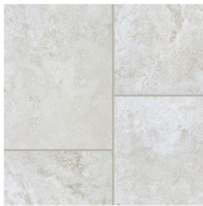
SILVER SAND SH60