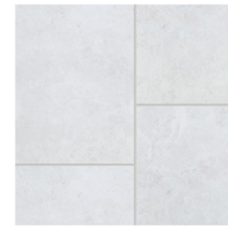
WHITE SAND SH62