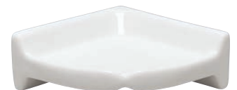
Gloss White Large Corner Shelf