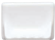
Gloss White Soap Dish*