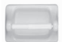
Gloss White Paper Holder*