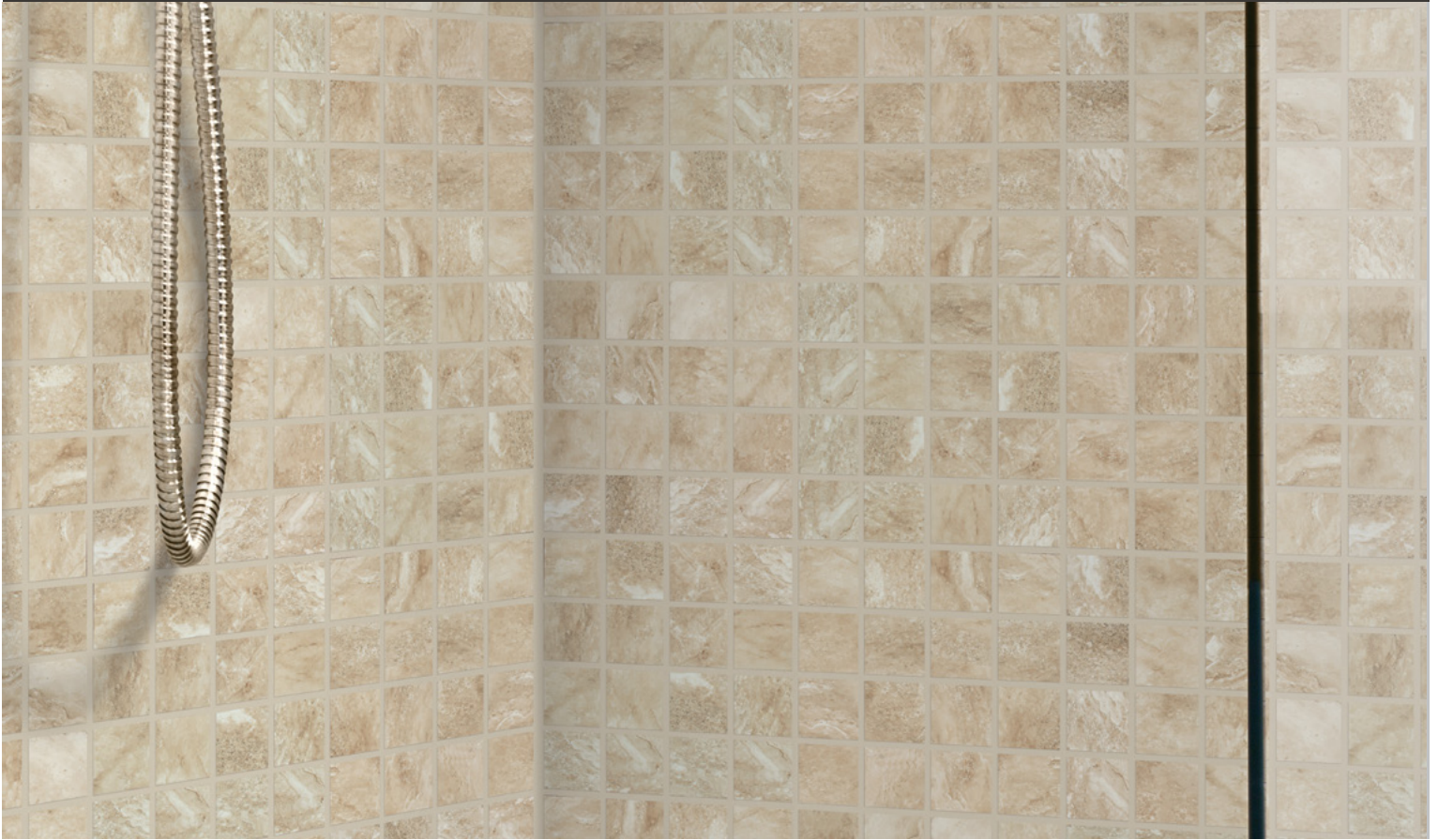
Cover & above: CLAY GP06