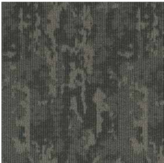
Oswego Tea 868