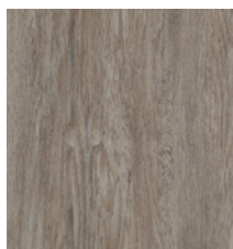
933 Weathered Gray