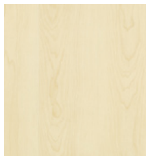
111 Pure Maple

Travel Light features a 12 mil commercial wear layer with M-Force™ Enhanced Urethane finish offering polish-optional for cost-effective maintenance.