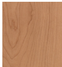
332 Carmel Maple