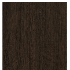
883 Coffee Bean