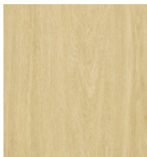
132 Flaxen Oak