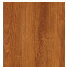
343 Rich Cherry