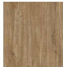
328 Weathered Hickory