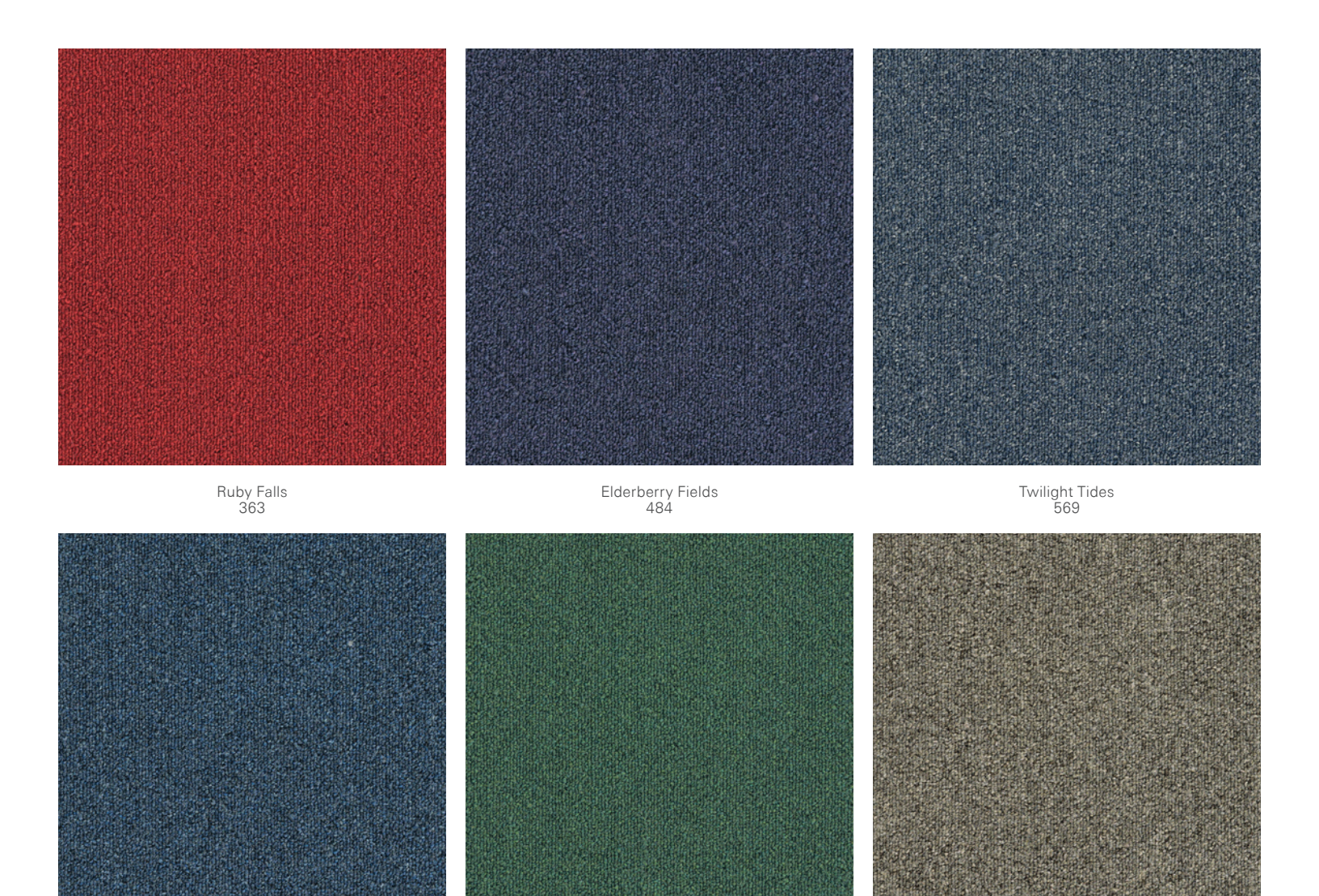
Cobalt Cliffside 575