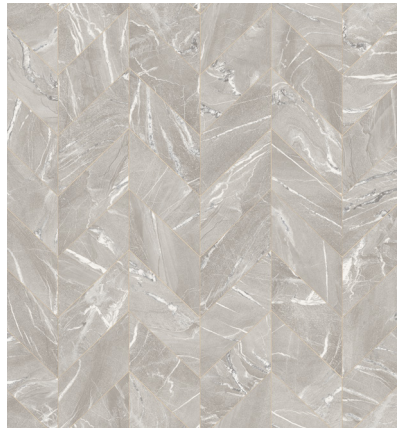
931 Mossy Gold