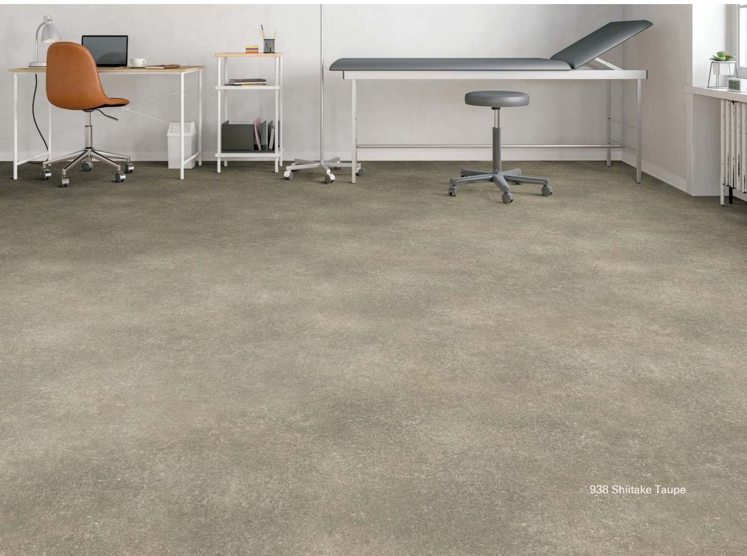
938 Shiitake Taupe