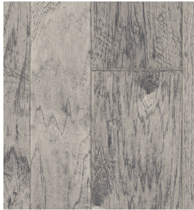
849 Rustic Greige