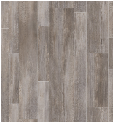
839 Crafted Clay