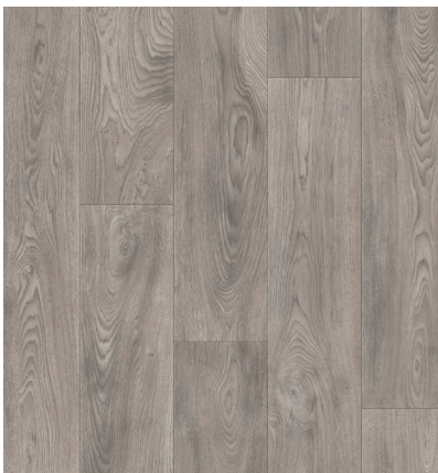
862 Fawn Gray