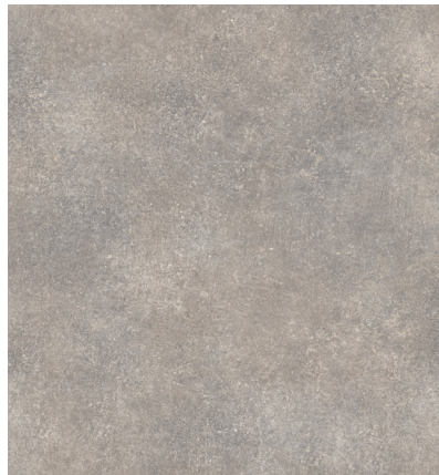
938 Shiitake Taupe