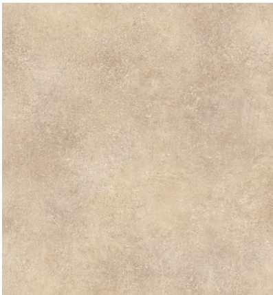
832 Toasted Truffle