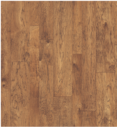
872 Copper Mountain