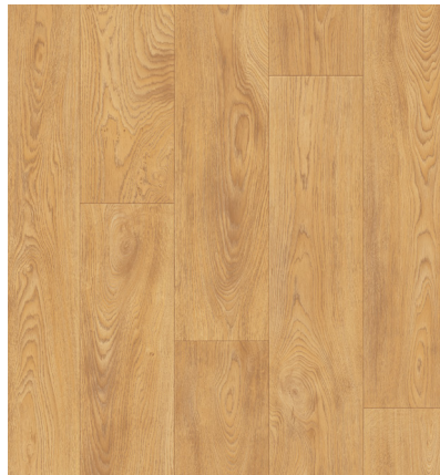
842 Gold Coast