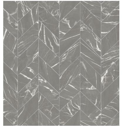
579 Earl Gray