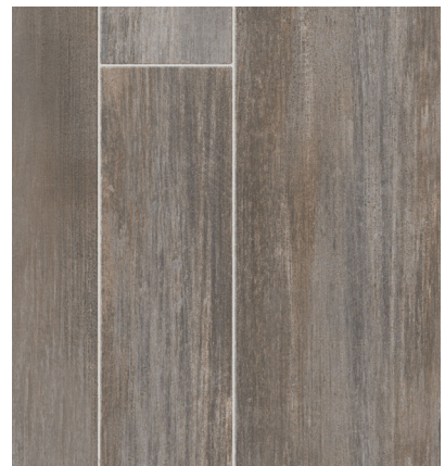
859 Felted Wool