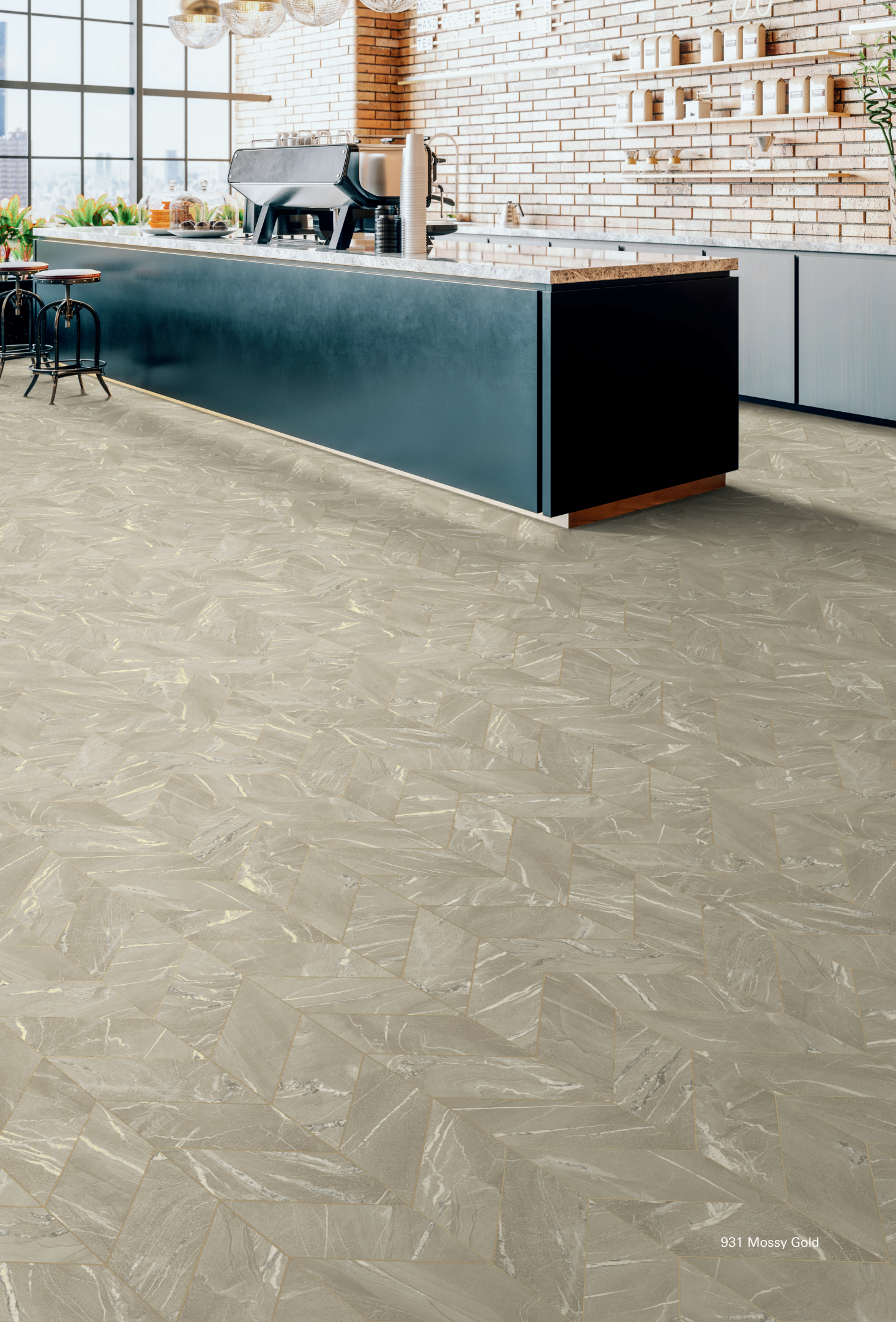
931 Mossy Gold