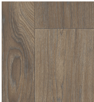
853 Pottery Urn