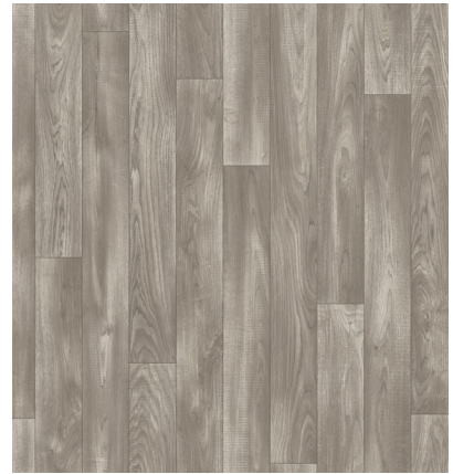
948 Cocoa Whip