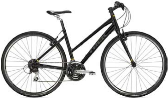
Livestrong FX WSD