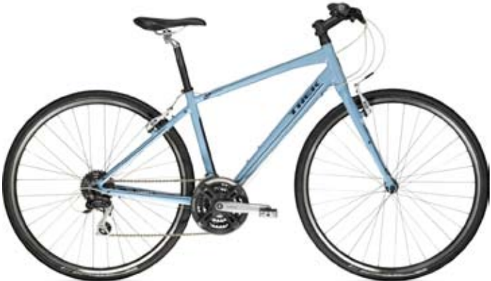
7.2 FX WSD