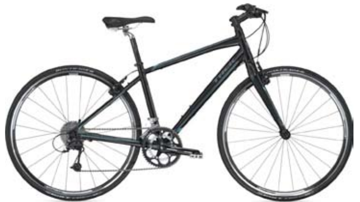
7.5 FX WSD