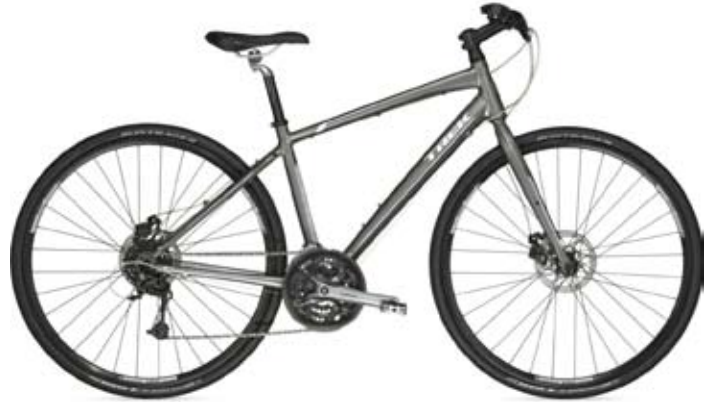
7.3 FX Disc WSD