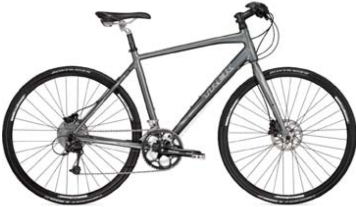
7.5 FX Disc