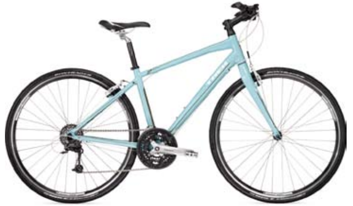
7.4 FX WSD