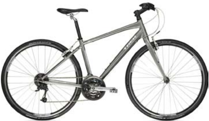
7.3 FX WSD