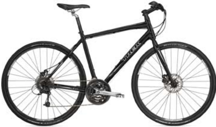
7.3 FX Disc