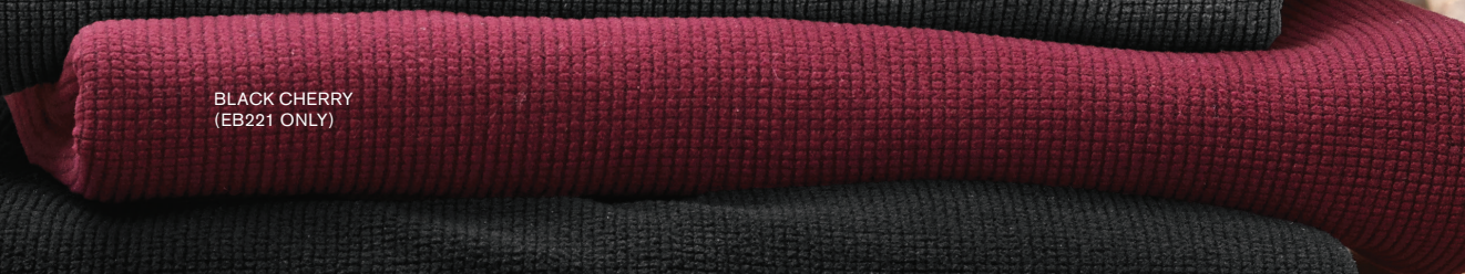
BLACK CHERRY (EB221 ONLY)