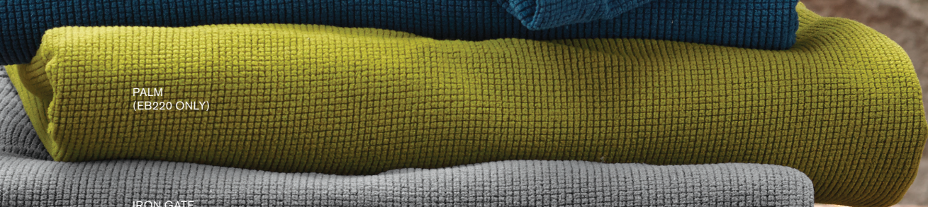
PALM (EB220 ONLY)