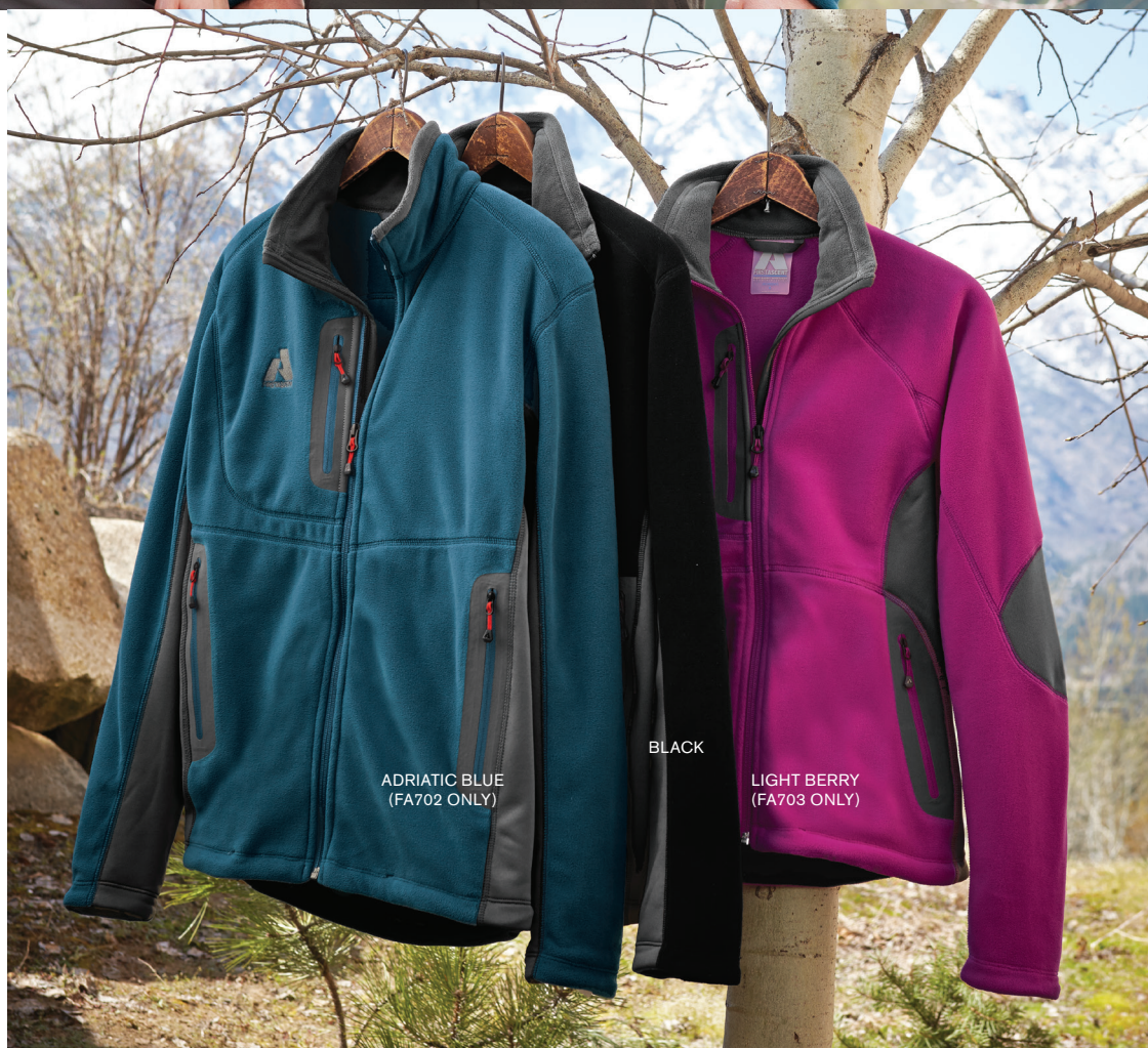
ADRIATIC BLUE (FA702 ONLY)

Contrast First Ascent logo on hem. LADIES SIZES: XS-4XL