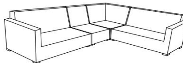
Figure 3 Suggest using 2 people